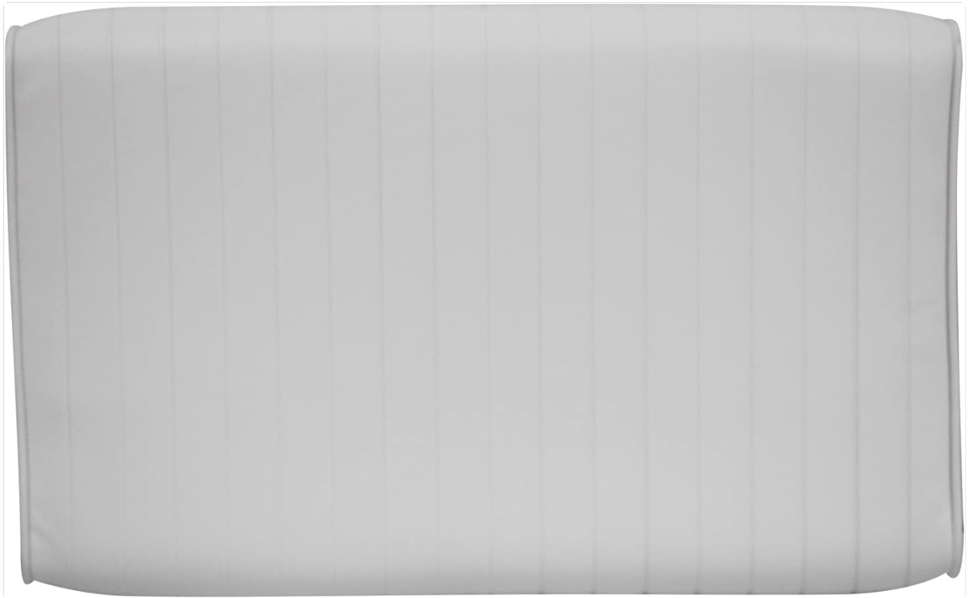
Image: Top view of the replacement seat cushion, showing its rectangular shape and ribbed vinyl surface.