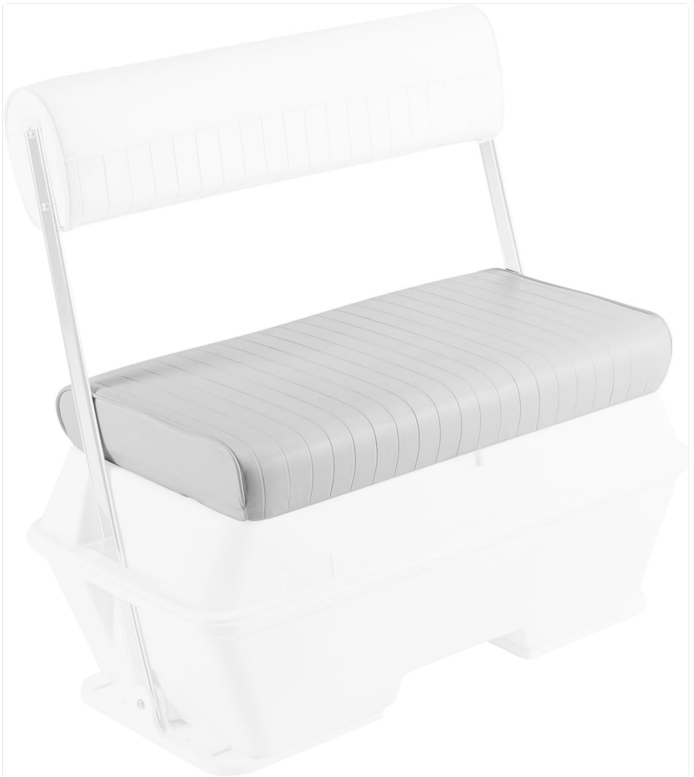
Image: The Wise 8WD159-R-S Replacement Seat Cushion shown installed on a compatible cooler seat frame, highlighting its design and fit.