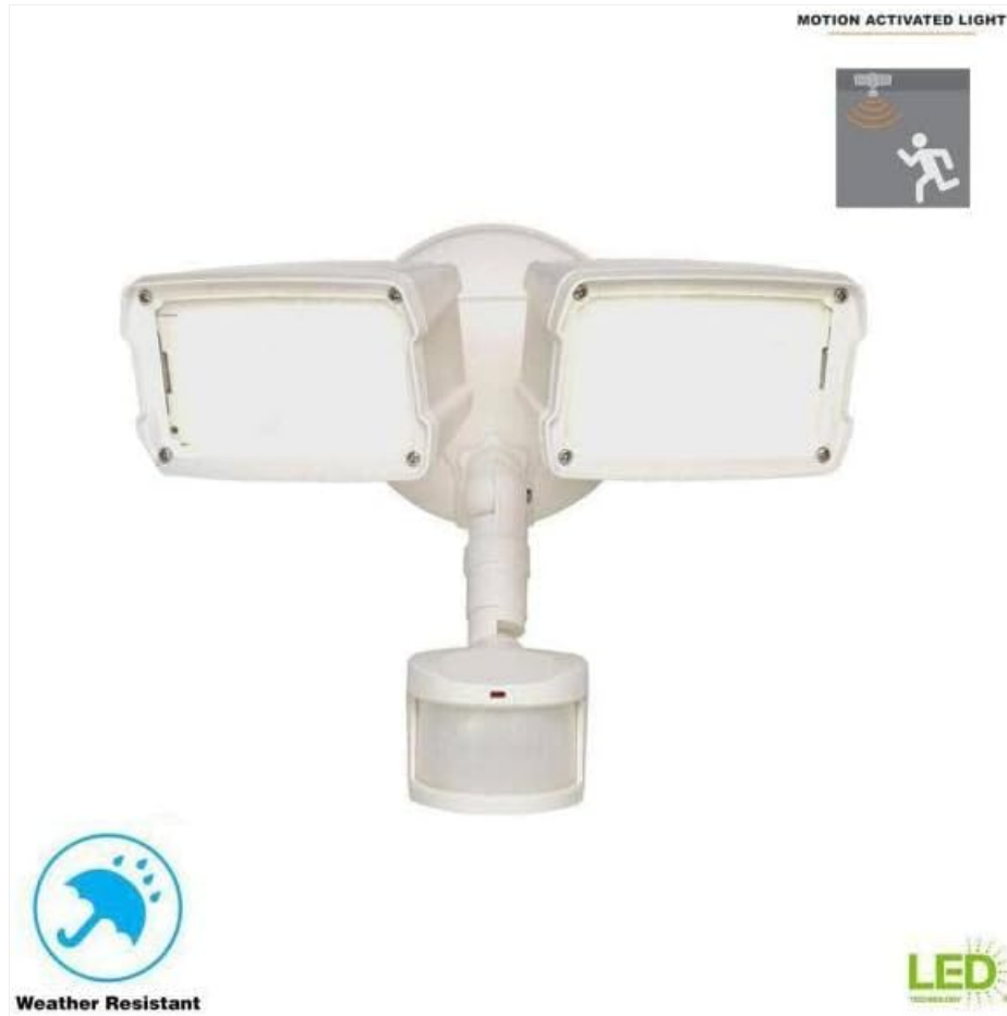
Image: The Defiant LED Security Floodlight with an overlay indicating its motion activation capability, showing a person icon and a motion sensor symbol.

The 180-degree motion sensor detects movement within a 70 ft. range. When motion is detected, the light will activate. The duration the light stays on can typically be adjusted via a control dial on the sensor (refer to the physical product for exact dial location and settings).