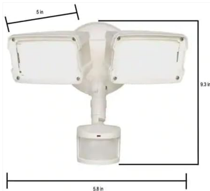
Image: A diagram illustrating the dimensions of the floodlight, including its length, width, and height, which are approximately 5 inches L x 5.8 inches W x 9.3 inches H.