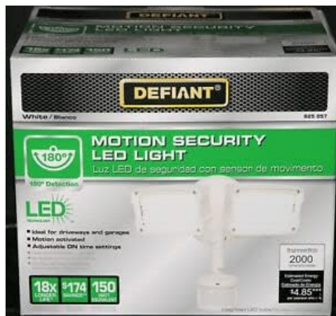
Image: The Defiant LED Security Floodlight shown in its retail packaging, highlighting its 180-degree motion detection and LED features.

Thank you for purchasing the Defiant 180 Degree Outdoor Motion Activated White LED Security Floodlight. This product is designed to provide dependable security lighting for your outdoor spaces. It features a wide detection range and an integrated dusk-to-dawn sensor for efficient operation.