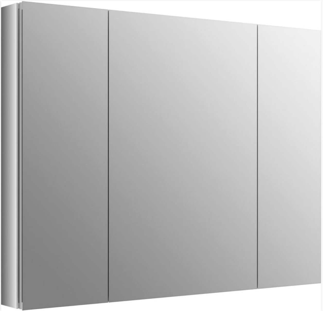
Image 1.1: Front view of the KOHLER Verdera medicine cabinet with its three mirrored doors closed, showcasing its sleek design.

Key features include triple mirrored doors that create a light-filled gallery effect, a fully mirrored interior, and three adjustable tempered-glass shelves for organized storage. The cabinet is equipped with two-way adjustable hinges offering a 108-degree opening capability for convenient access.