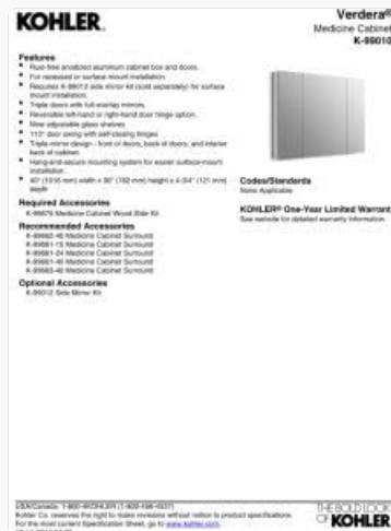
Image 3.1: Technical drawing illustrating the dimensions and installation requirements for the KOHLER Verdera medicine cabinet, including wall opening sizes and door swing angles.

For detailed, step-by-step instructions, refer to the official Installation Manual (PDF) provided by KOHLER.