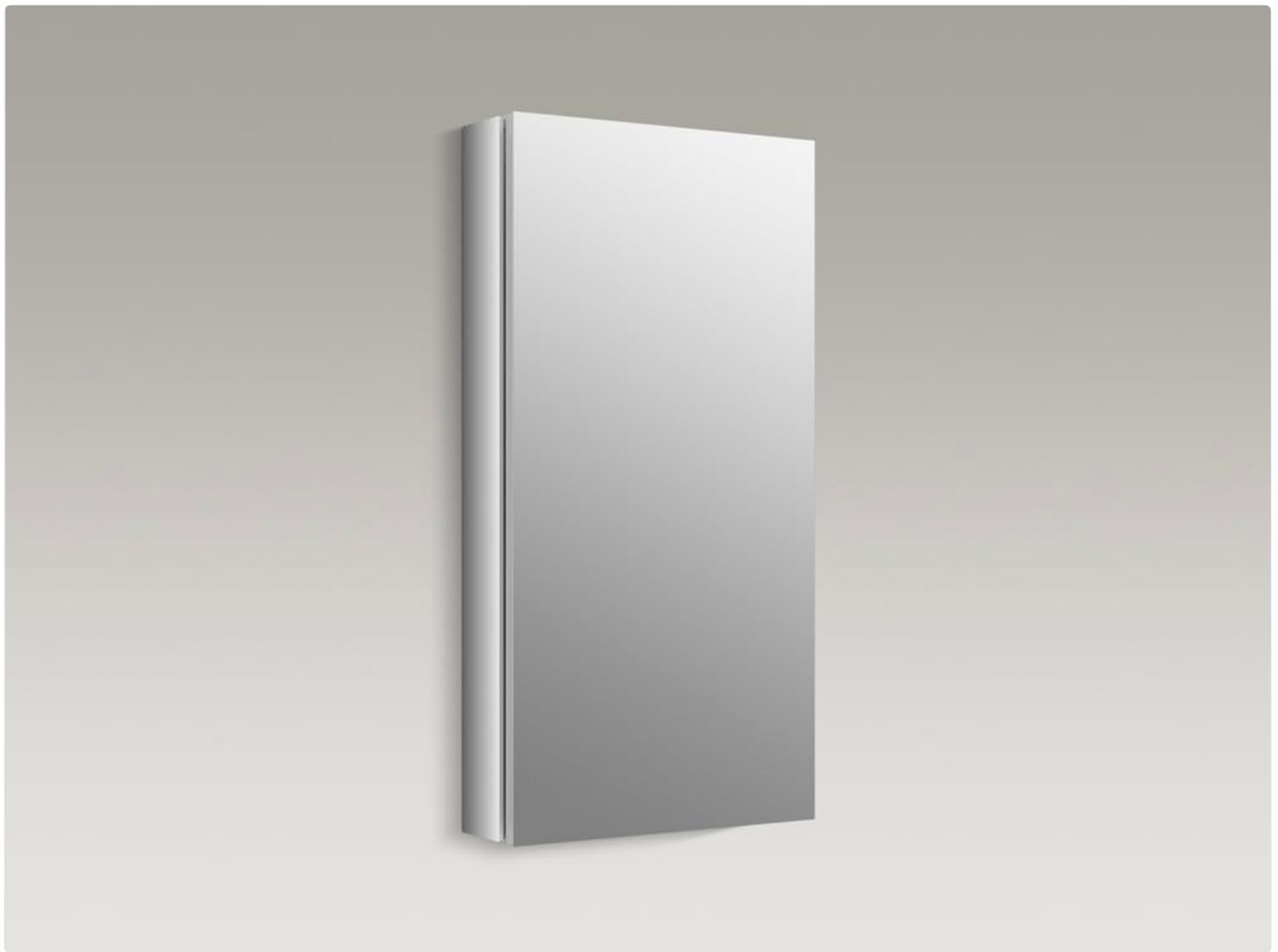
Front view of the KOHLER Verdera 15" W x 30" H Medicine Cabinet, showcasing its full-overlay mirrored door.