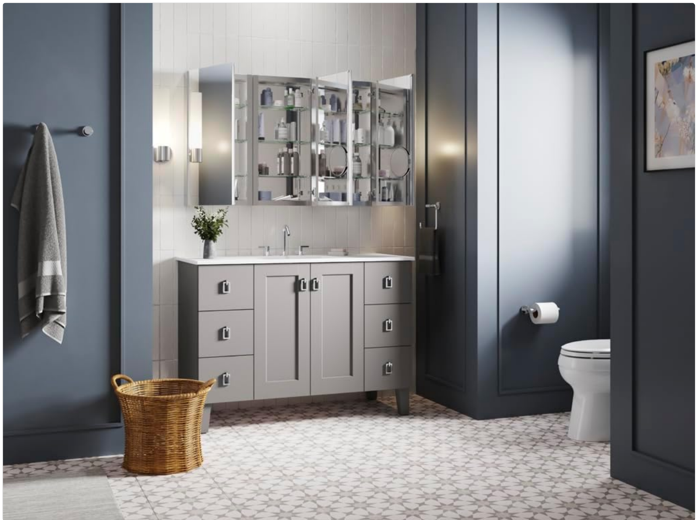
Interior view of the KOHLER Verdera Medicine Cabinet, featuring adjustable glass shelves and a magnifying mirror.