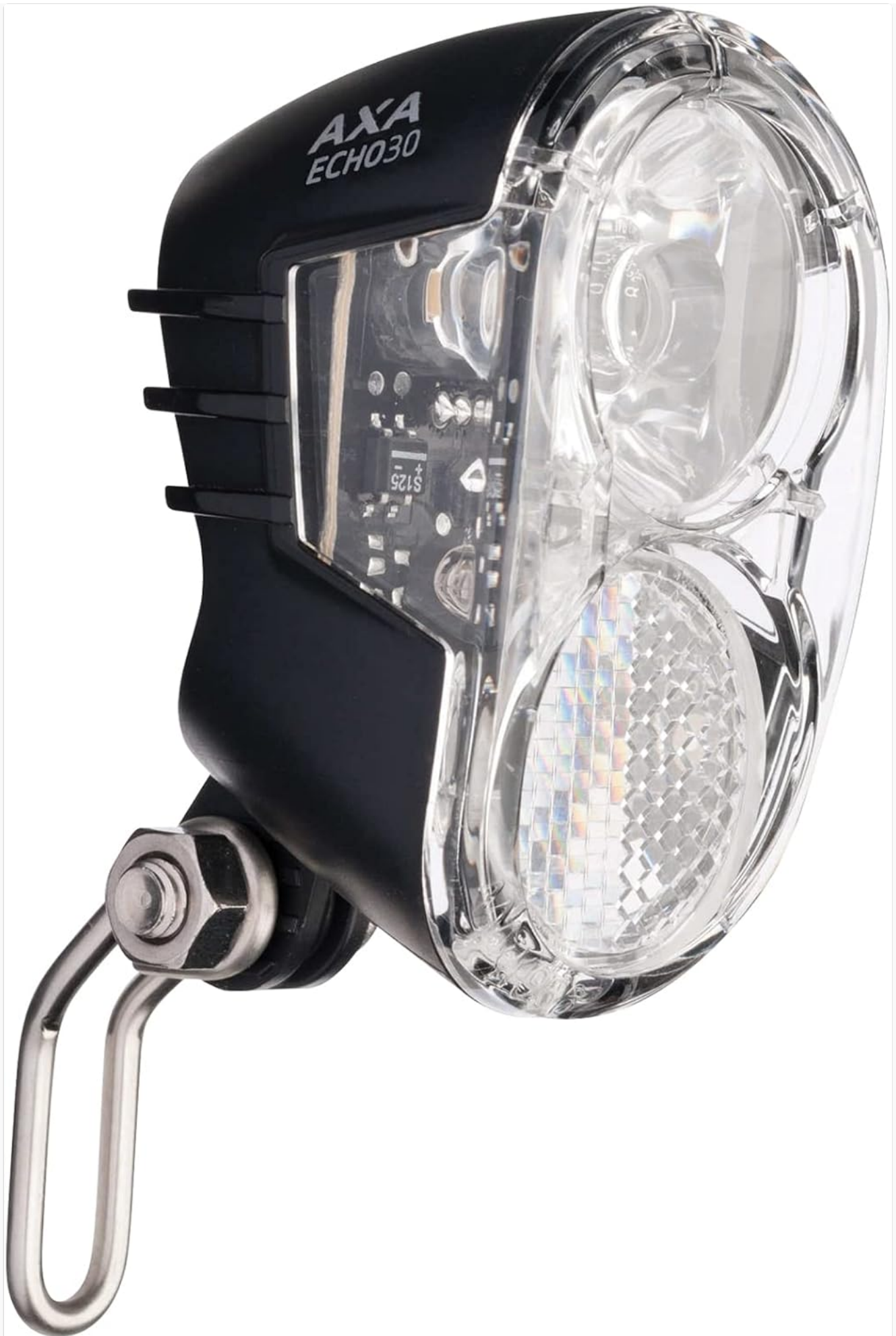
Figure 1: AXA Echo 30 Bicycle Light. This image shows the overall design of the light, highlighting its clear lens, integrated reflector, and the robust housing.