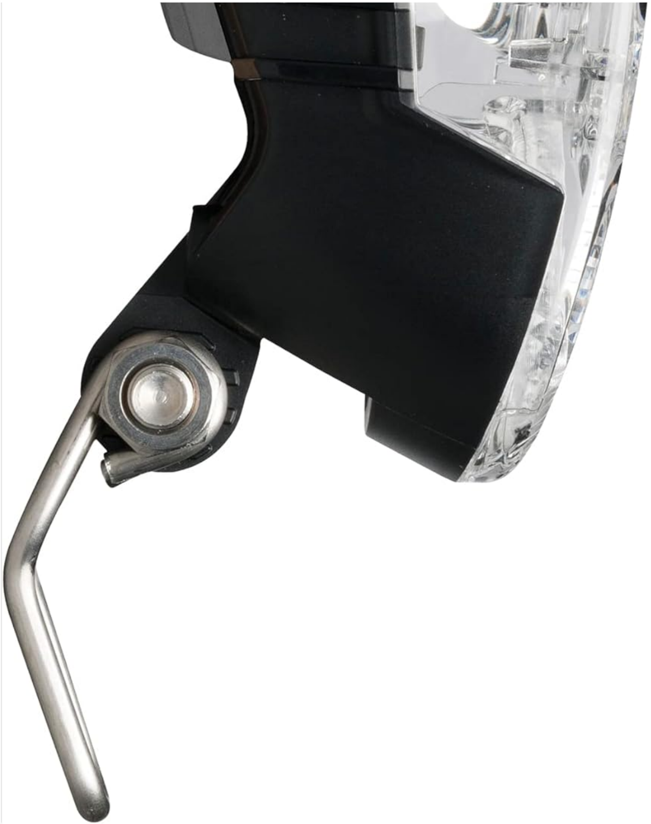
Figure 2: Side view of the AXA Echo 30 showing the stainless steel mounting bracket. This image illustrates how the light attaches to the bicycle frame or fork.