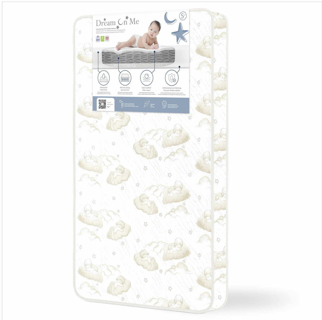
Image: Dream On Me Twilight Crib Mattress in a standard crib setup.