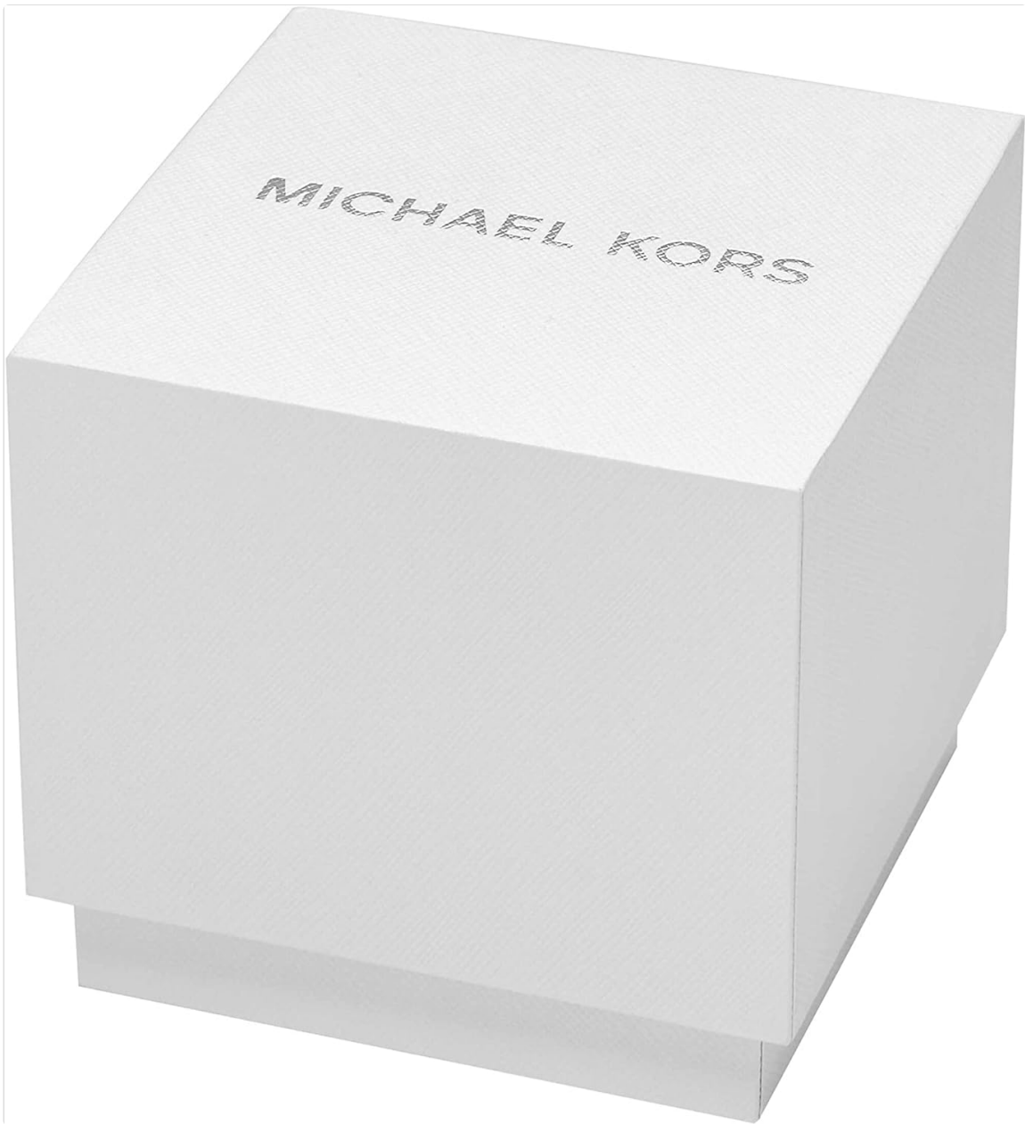
Image: The Michael Kors watch packaging box, indicating the product's original presentation.