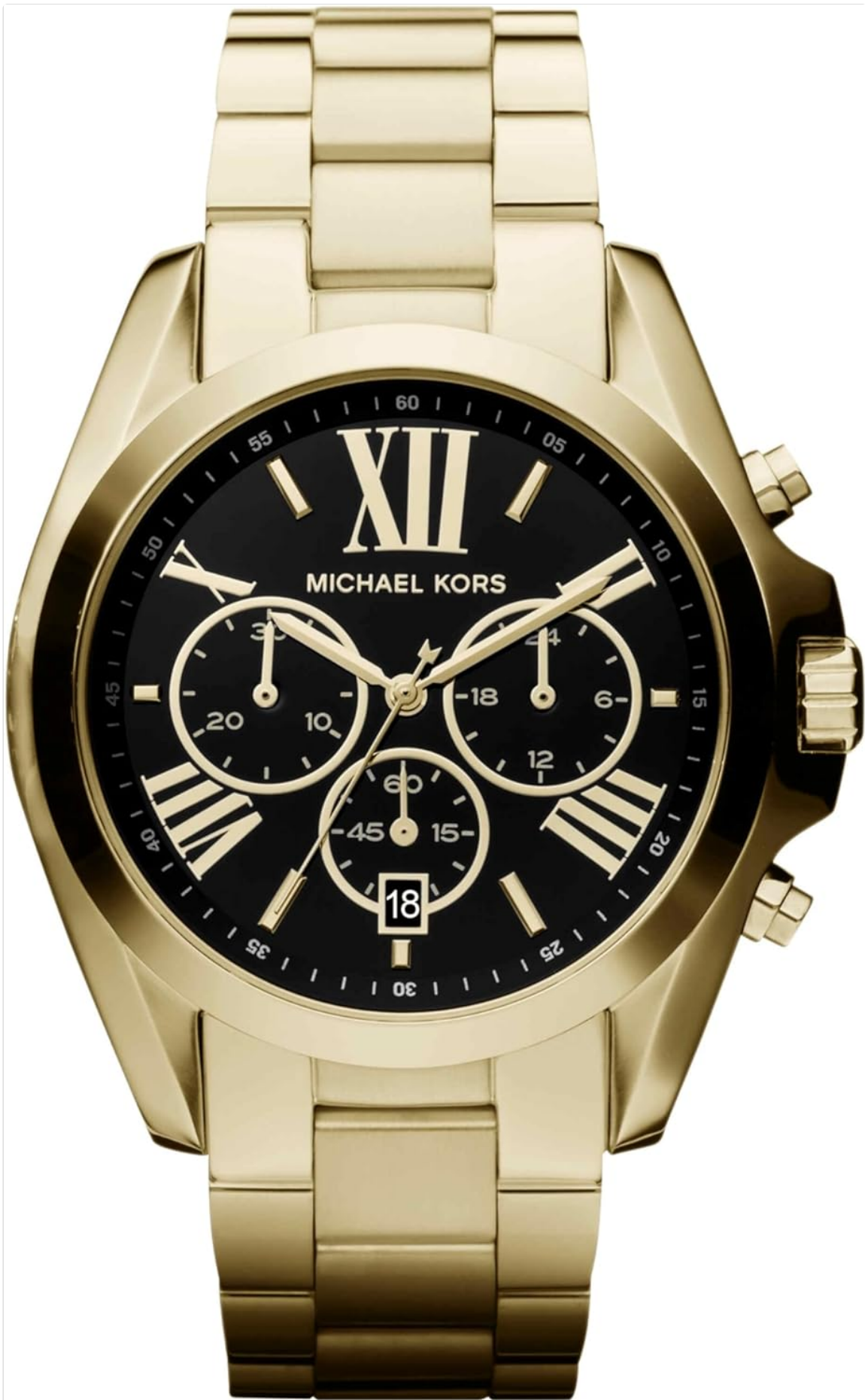
Image: Front view of the Michael Kors Bradshaw watch, showcasing its gold-tone case, black dial, and chronograph subdials.