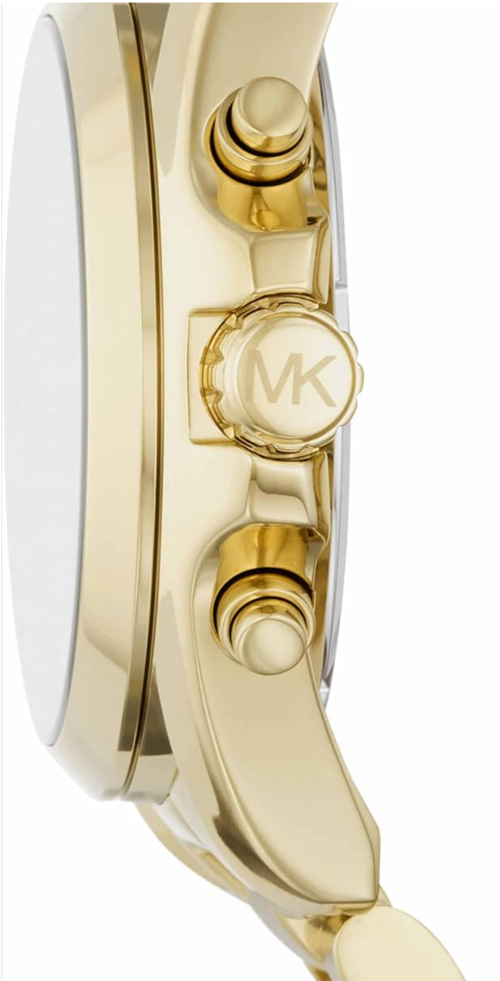
Image: Side view of the watch, highlighting the crown and chronograph pushers for time and function adjustments.