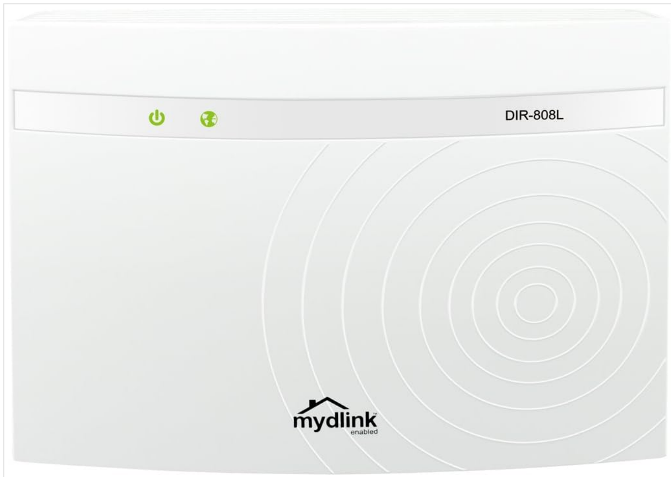
Figure 4.1: Front view of the DIR-808L router with power and internet status indicators.

Familiarize yourself with the physical components and ports of your DIR-808L router.