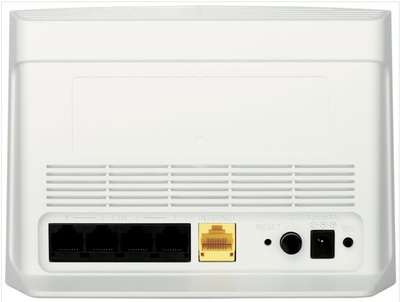
Figure 4.2: Rear panel of the DIR-808L router, detailing port layout.