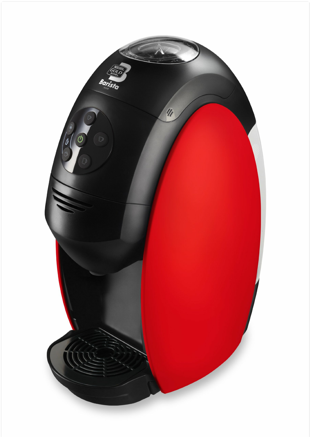
Image: The Nescafe Gold Blend Barista PM9631 coffee machine, showcasing its design and a coffee being prepared.