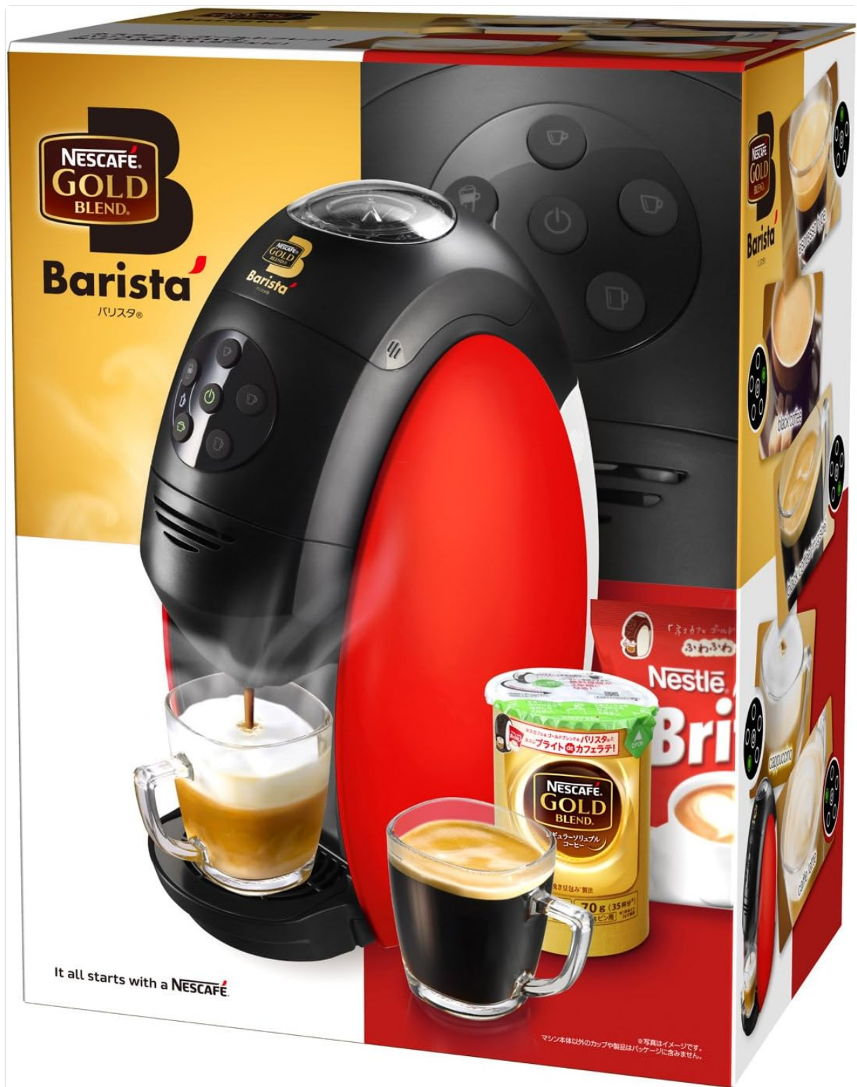
Image: The coffee machine in a setting with prepared beverages, emphasizing the importance of regular cleaning for hygiene and taste.