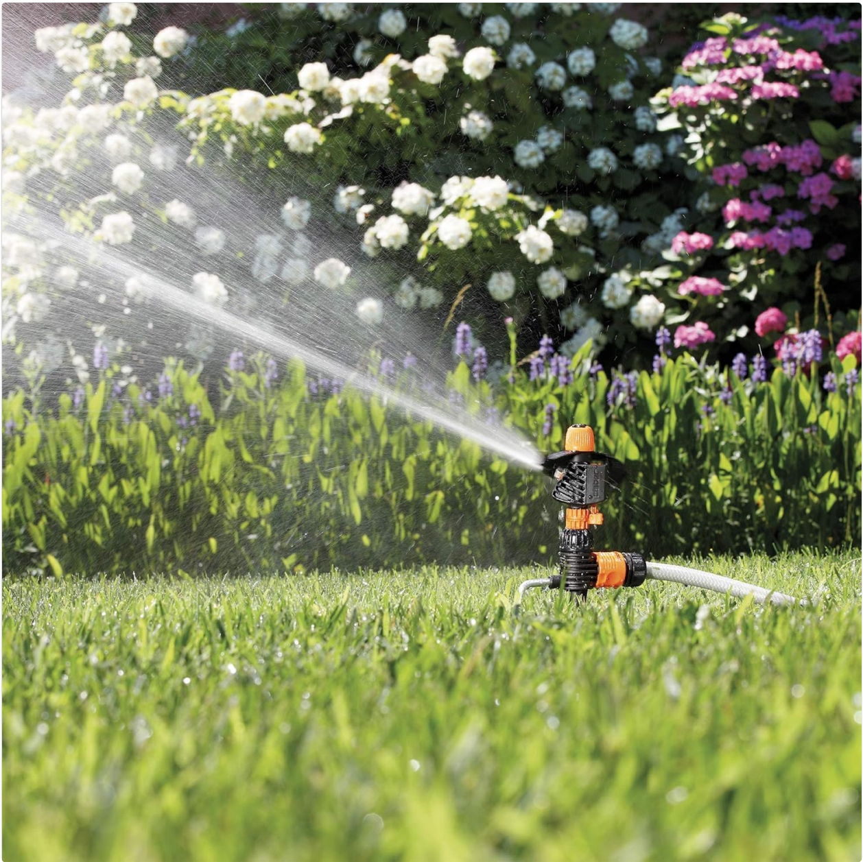
Figure 5.1: The Claber 8707 Impact Spike Sprinkler actively watering a lawn, demonstrating its effective spray coverage.