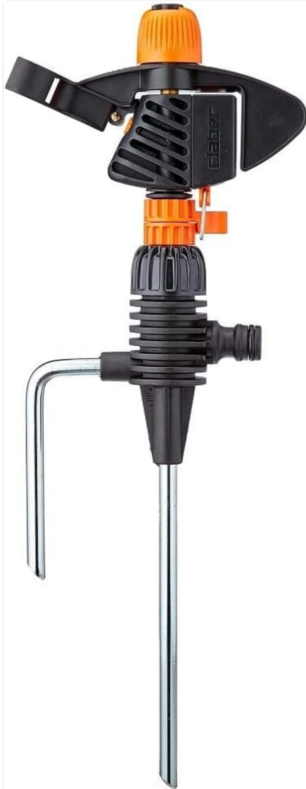
Figure 3.1: The Claber 8707 Impact Spike Sprinkler, showcasing its black and orange components and sturdy spike design.