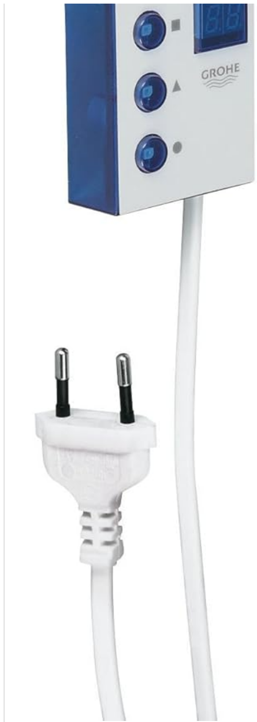
Figure 1: GROHE 64510000 Control Unit. This image shows the control unit with its attached power cable and a separate connector cable, highlighting its compact design and connectivity.