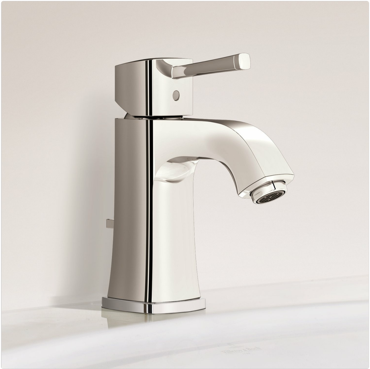
Figure 3: The GROHE Grandera Basin Faucet seamlessly integrated into a bathroom environment.