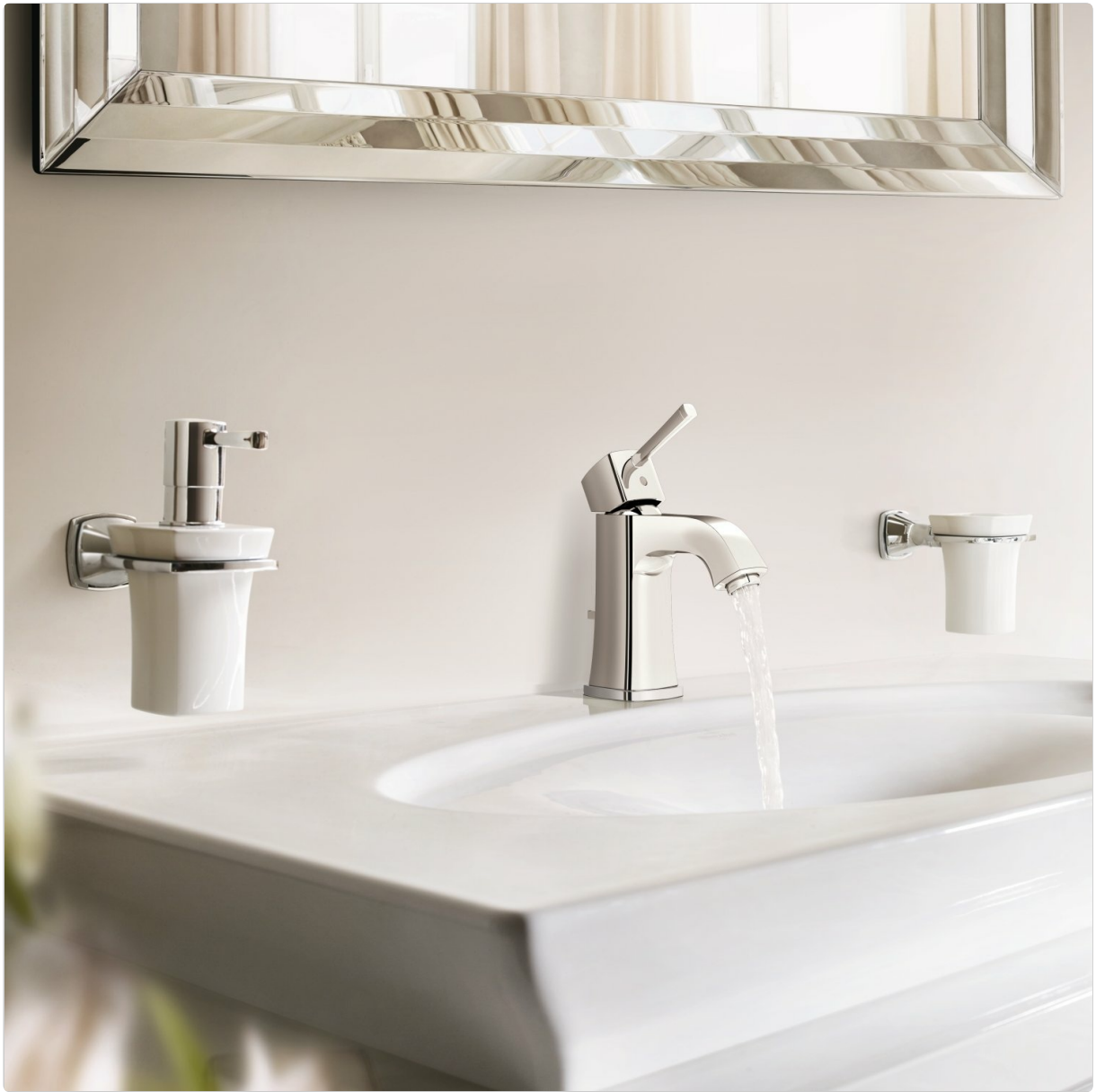
Figure 4: The faucet in operation, demonstrating water flow into a basin.