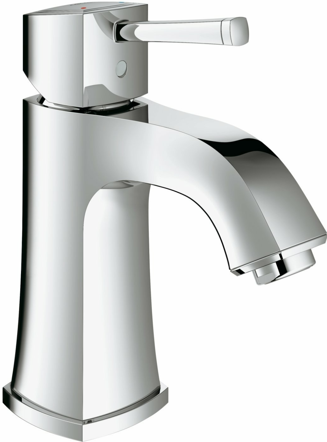
Figure 1: The GROHE Grandera Basin Faucet 23310000, showcasing its chrome finish and elegant design.