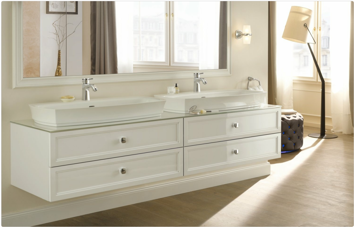
Figure 5: Multiple GROHE Grandera Faucets in a bathroom setting, highlighting their consistent finish and design.