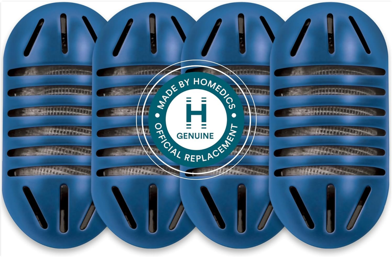
Image: Four HoMedics Demineralization Cartridges, indicating they are genuine official replacements.

Each package contains four cartridges, providing an extended period of use before replacement is needed. Each cartridge is designed to last for approximately 30-40 full tank uses, though this can vary based on the hardness of your water.