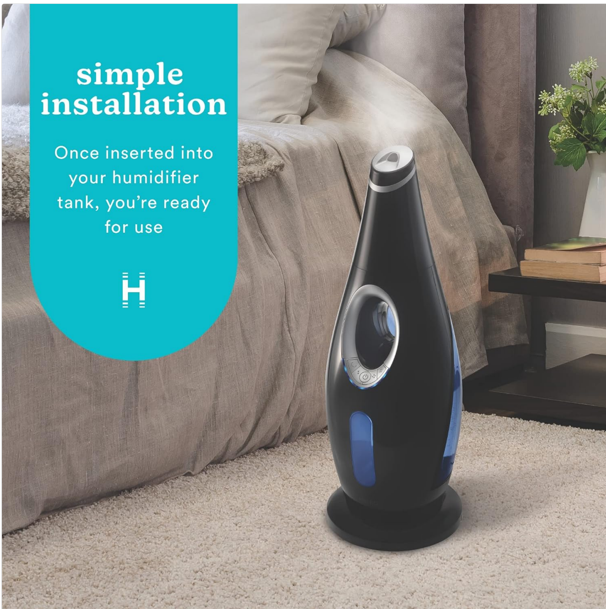
Image: A HoMedics humidifier, demonstrating the simplicity of installation.