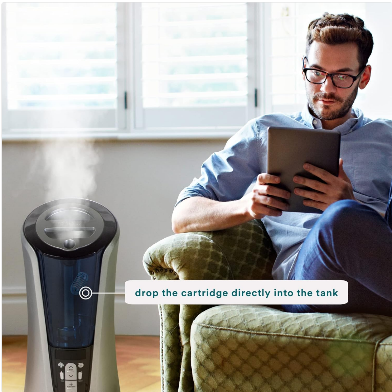
Image: Visual guide for dropping the cartridge into the humidifier tank.