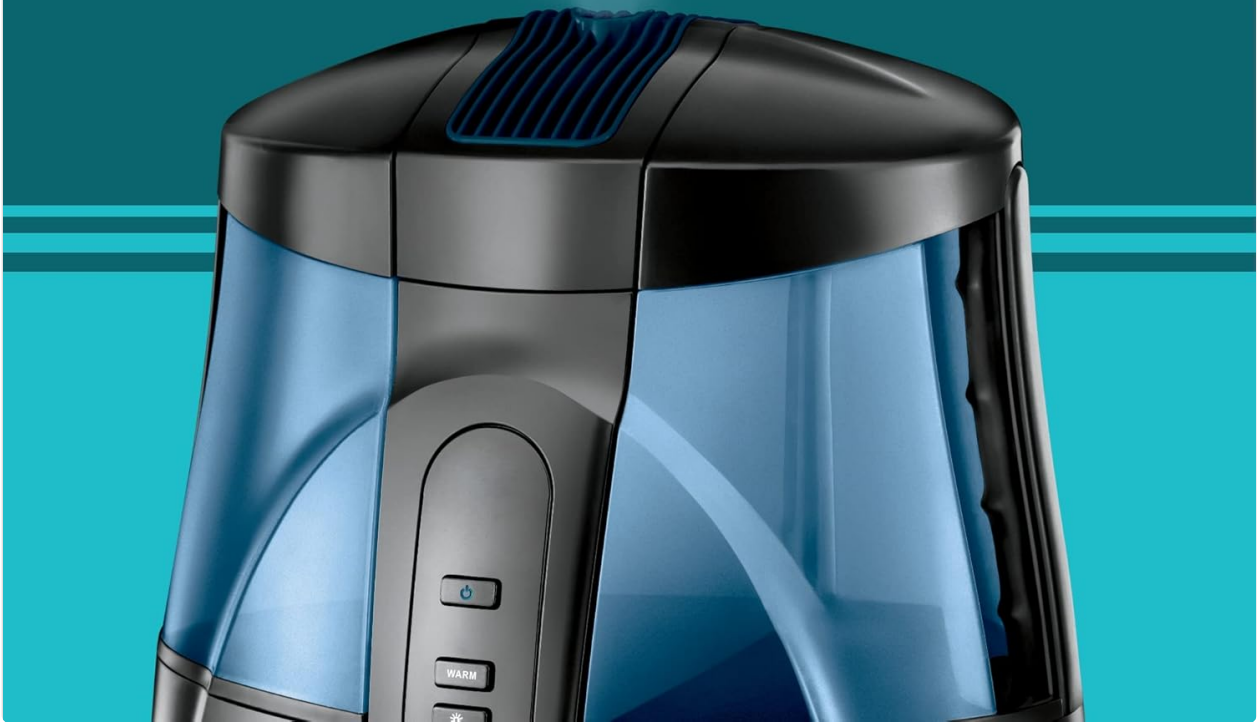
Image: Illustrates compatibility with HoMedics ultrasonic humidifiers.

The demineralization cartridges work with any HoMedics ultrasonic humidifier that has a 1 gallon tank or larger