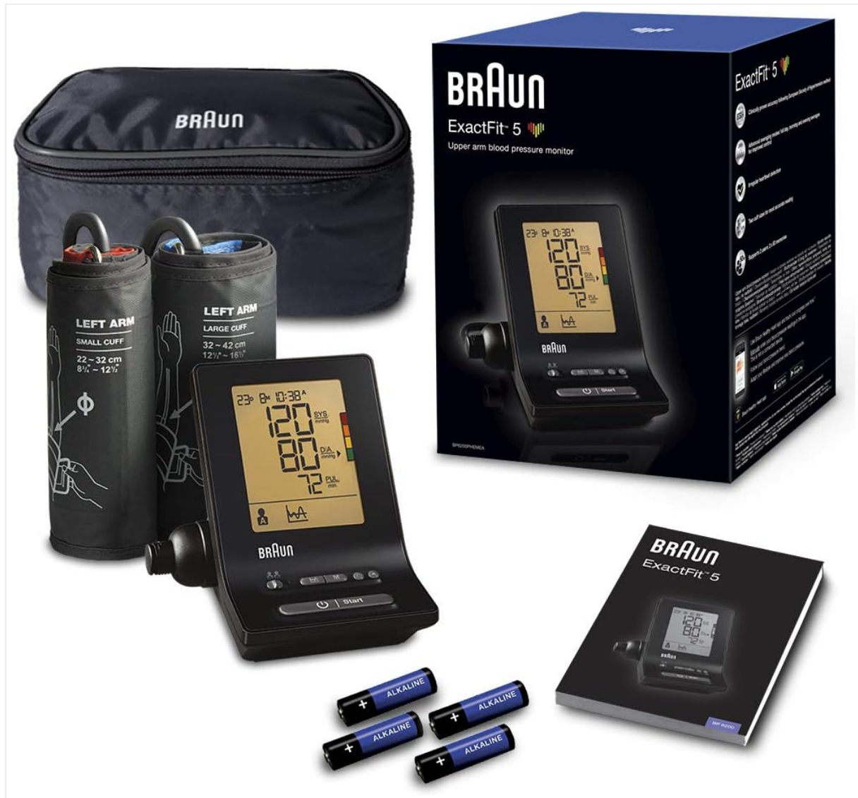
Image: Contents of the Braun ExactFit 5 package, including the monitor, two cuffs (small and standard/large), 4 AA batteries, and a storage bag.