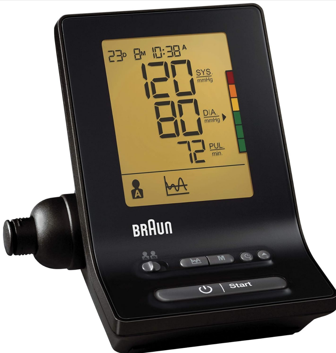
Image: The digital display of the Braun ExactFit 5 monitor showing systolic (SYS), diastolic (DIA), and pulse (PUL) readings, along with a color-coded indicator.