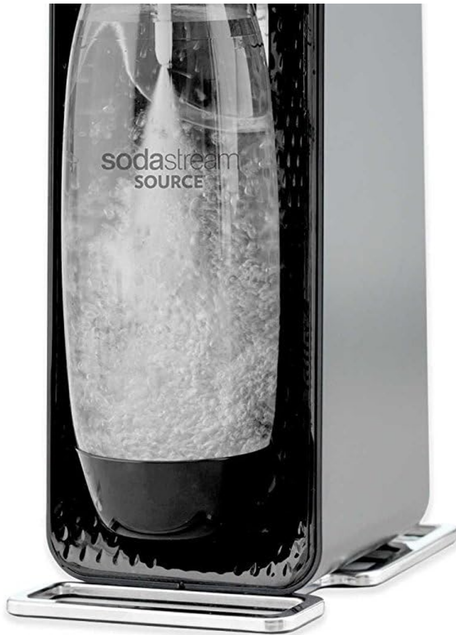
Image: The SodaStream Source Sparkling Water Maker, a sleek black device with a clear carbonating bottle attached, ready for use.