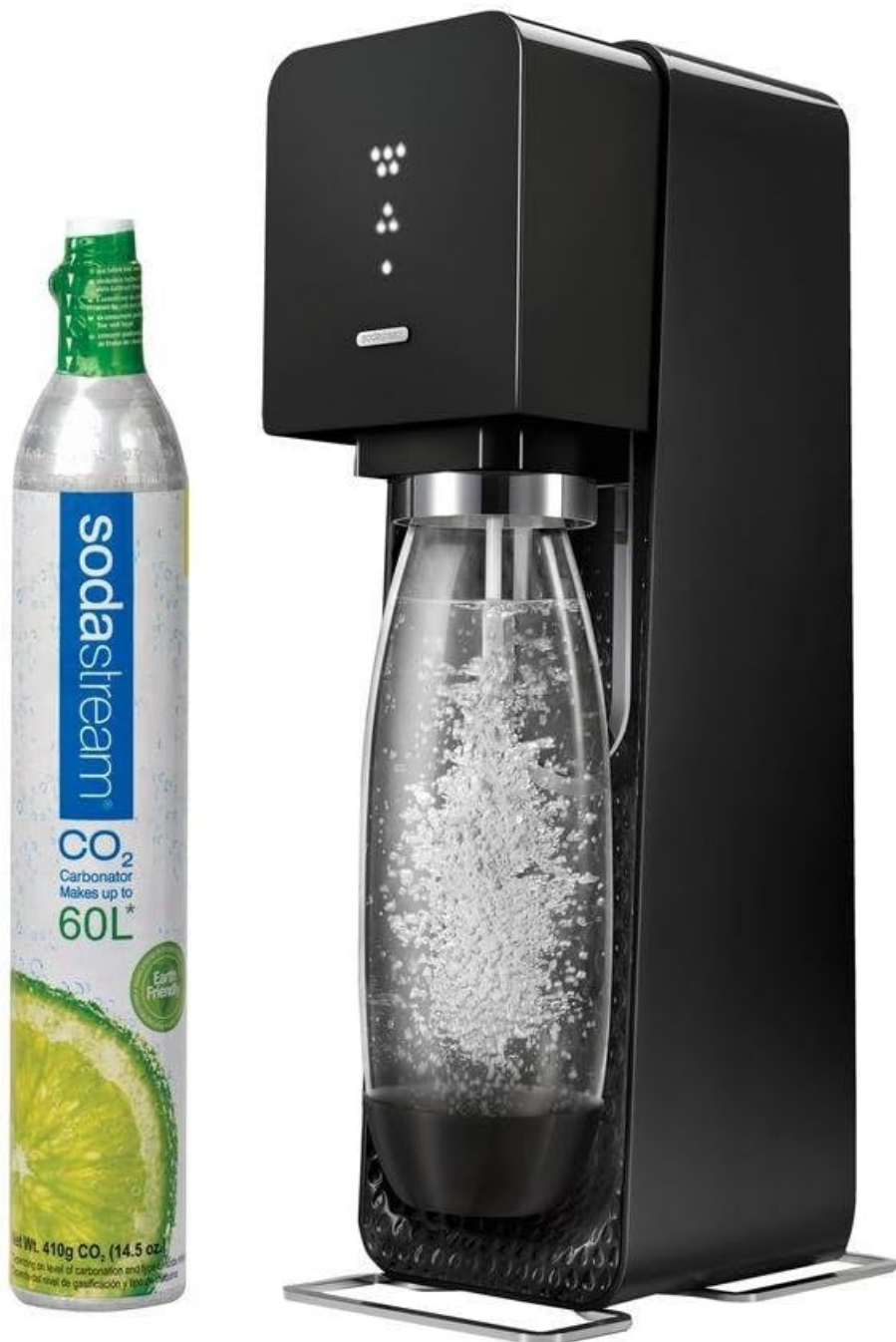
Image: The SodaStream Source machine shown alongside a SodaStream CO2 cylinder, illustrating the components involved in the setup.