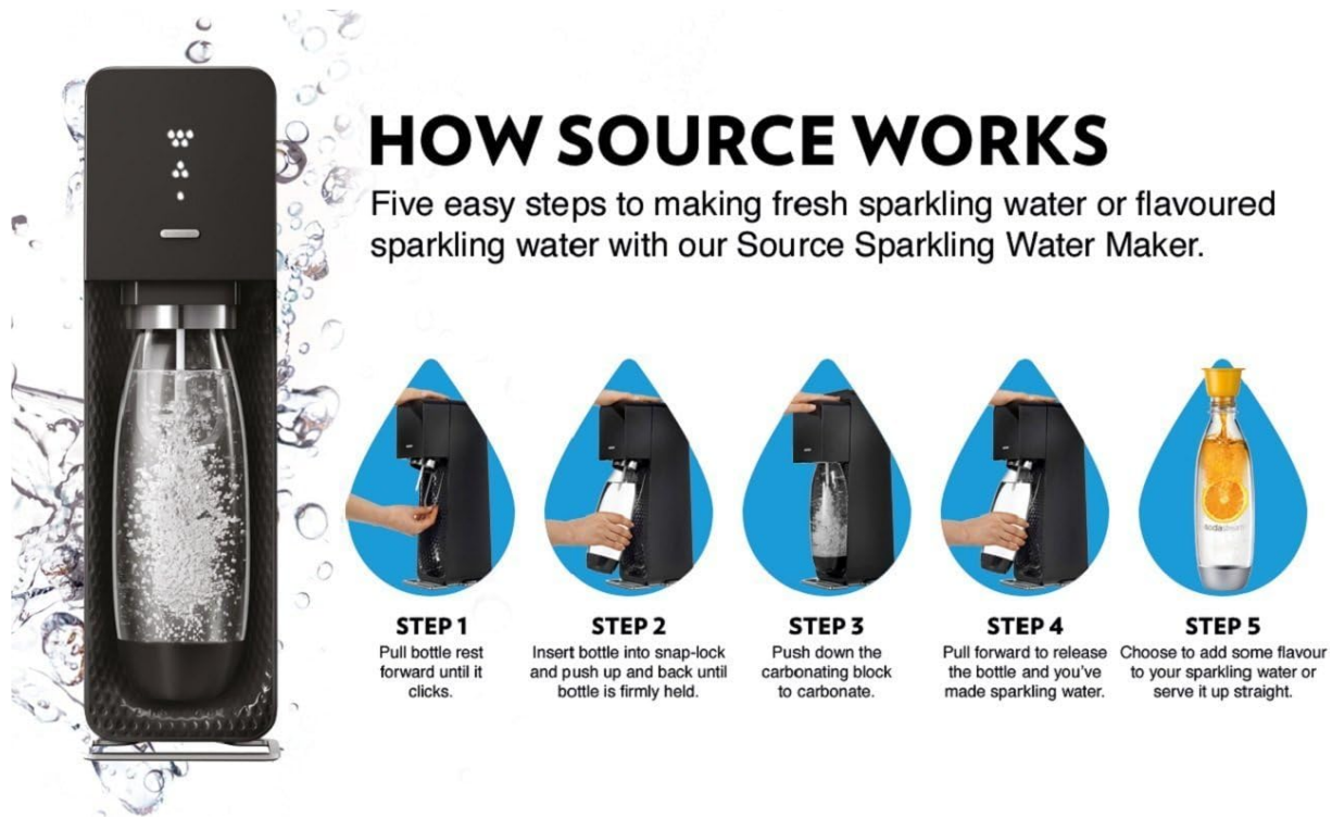
Image: A step-by-step diagram illustrating the five easy steps to make sparkling water with the SodaStream Source, from inserting the bottle to carbonating and adding flavor.

indicators on the machine will light up to show the carbonation strength (one light for light fizz, three for strong fizz).