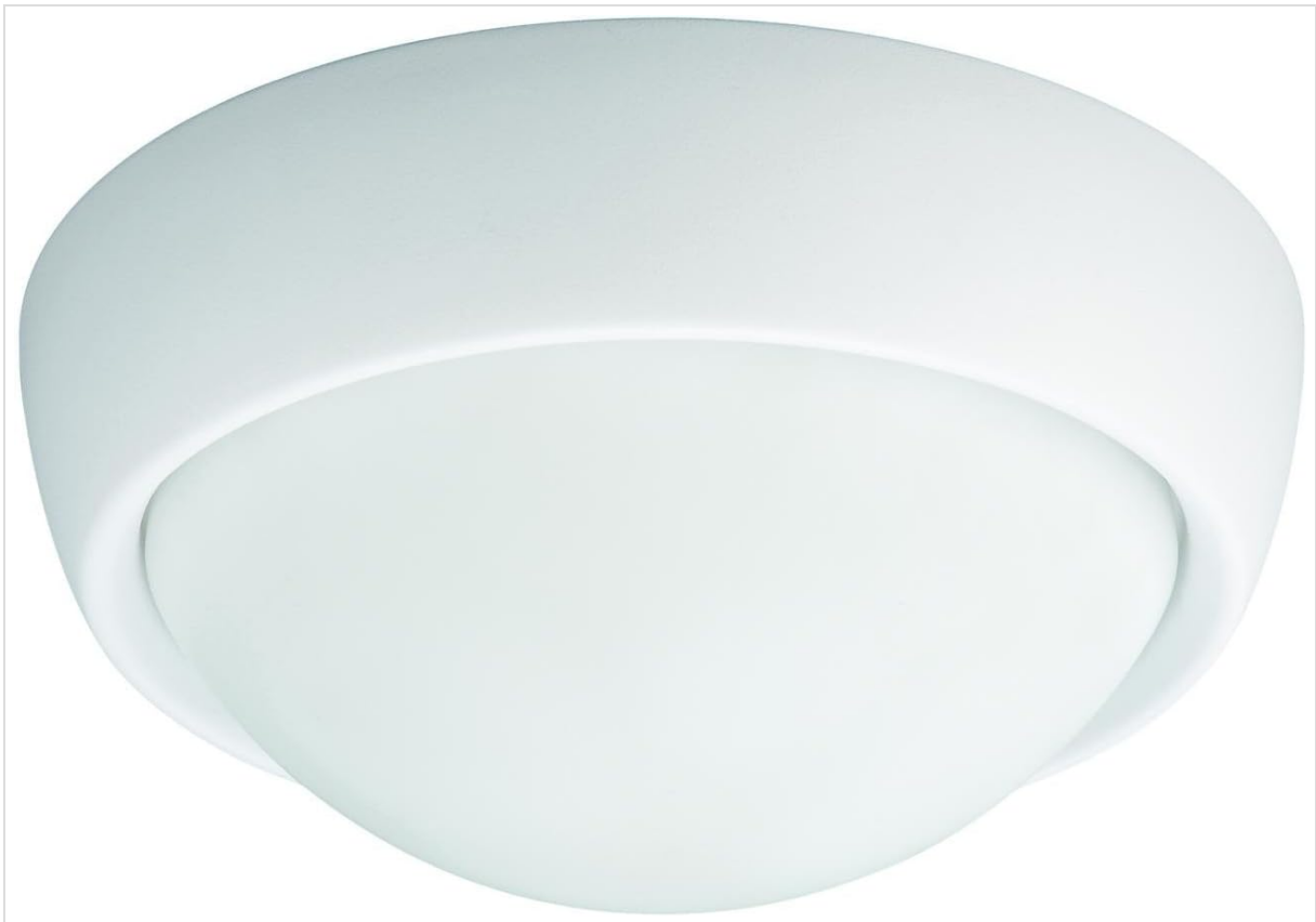
Figure 1: Philips Celestial Ceiling Lamp, front view. A white, dome-shaped Philips Celestial ceiling lamp with a translucent diffuser, designed for even light distribution.

Turn on the main power supply at the circuit breaker. Test the lamp to ensure it functions correctly.