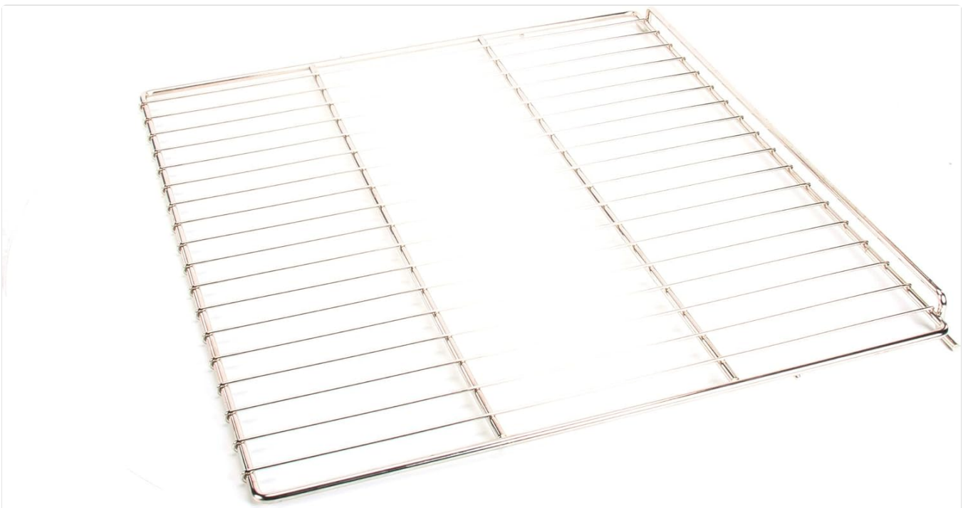
Image 1: Top-down view of the American Range A31000 Majestic Oven Rack, showing its rectangular shape and parallel wire construction.