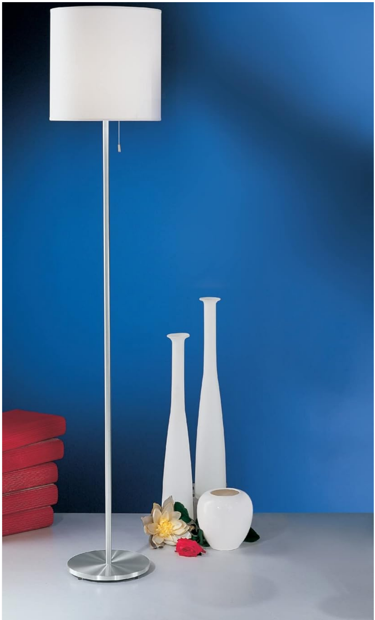
Figure 5.1: EGLO Sento Floor Lamp in a living room setting.