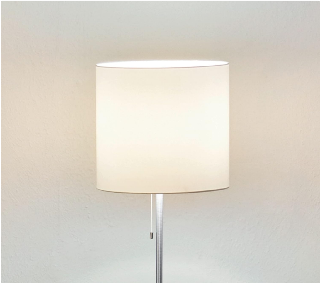
Figure 4.1: Fully assembled EGLO Sendo Floor Lamp.