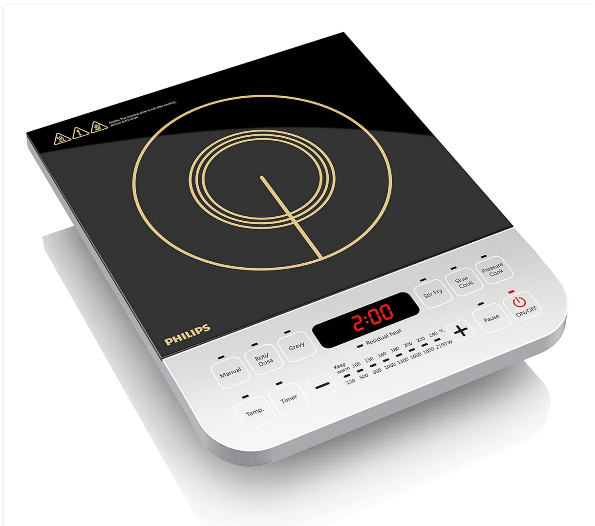
Image 2.1: Front view of the Philips HD4928/01 Induction Cooktop, showcasing its sleek black crystal glass surface and white control panel with soft-touch buttons and a digital display.