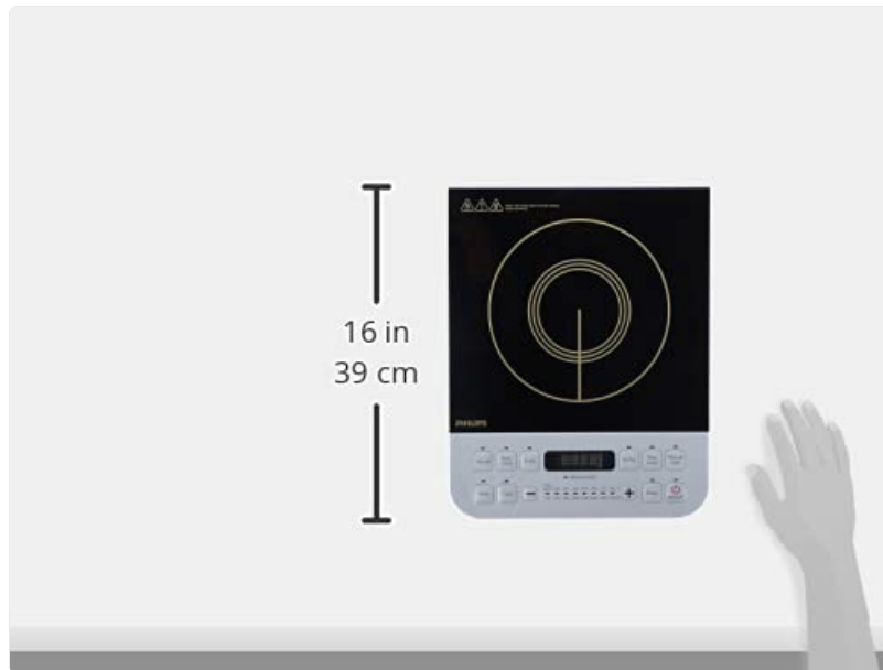
Image 3.1: Diagram showing the approximate dimensions of the Philips HD4928/01 Induction Cooktop, indicating a length of 16 inches (39 cm).