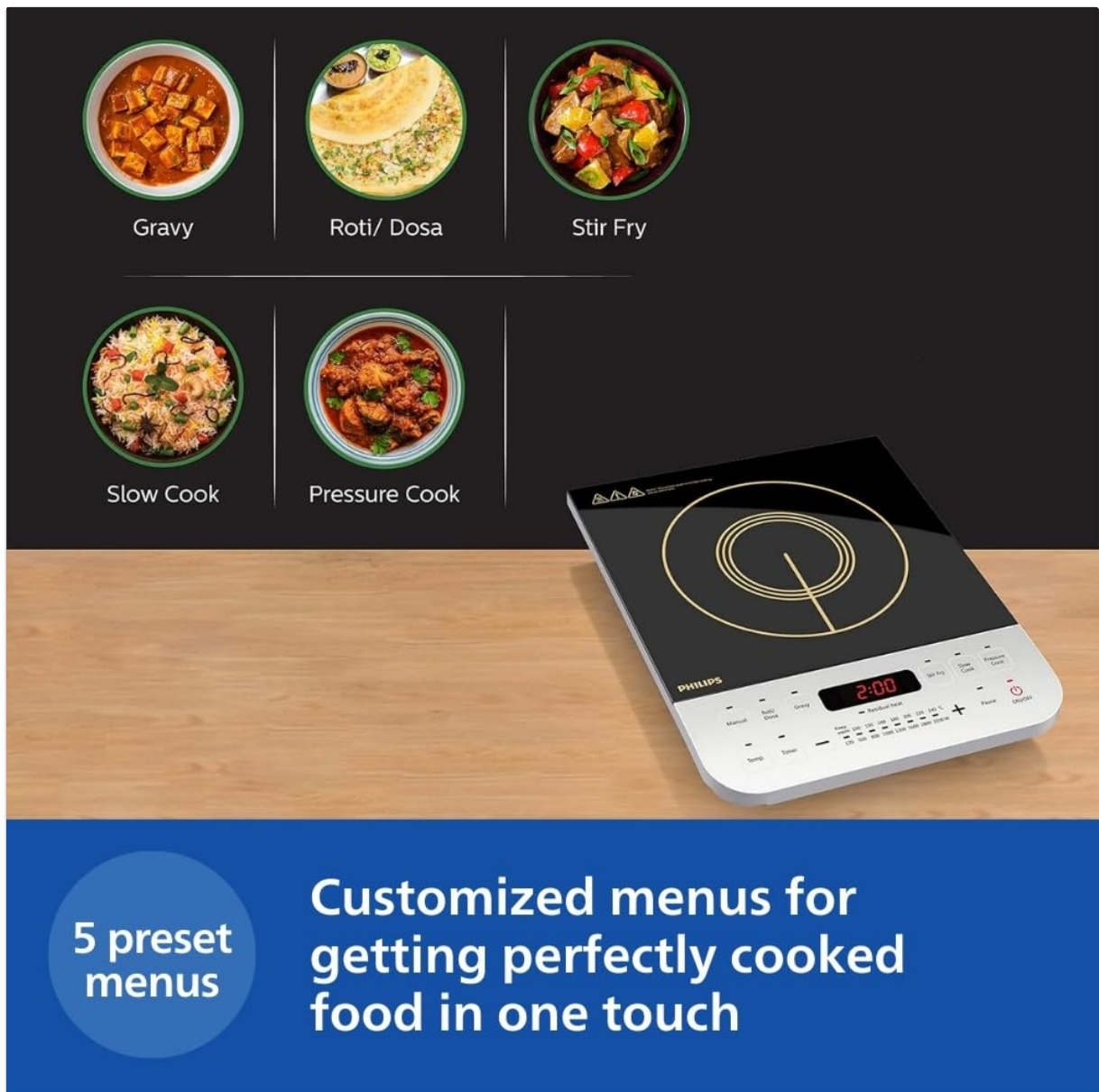
Image 4.2: Visual representation of the 5 preset menus available on the Philips HD4928/01 Induction Cooktop: Gravy, Roti/Dosa, Stir Fry, Slow Cook, and Pressure Cook.