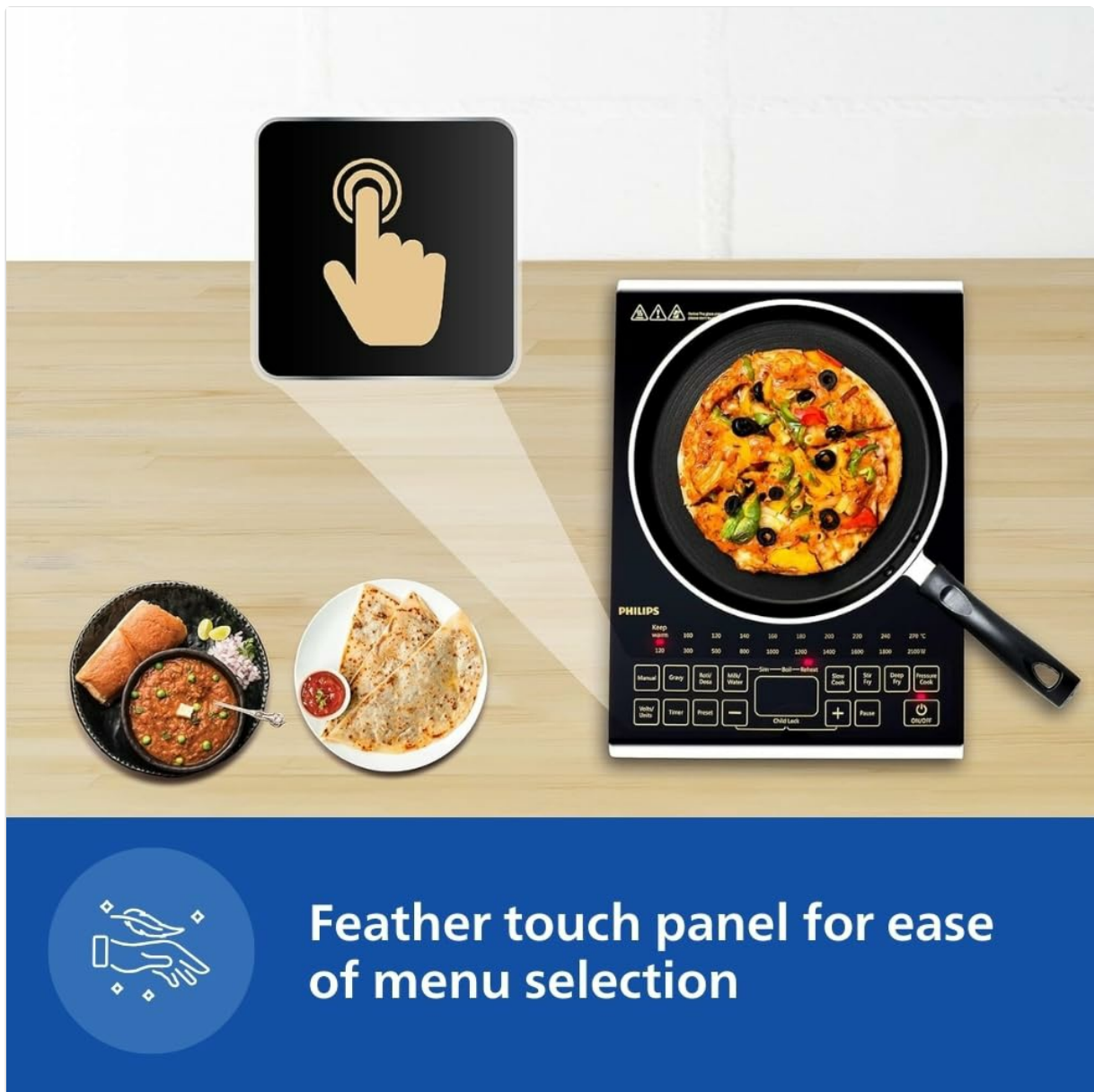
Image 4.1: Close-up of the Philips HD4928/01 Induction Cooktop's control panel, highlighting the soft-touch buttons for various functions and the digital display.