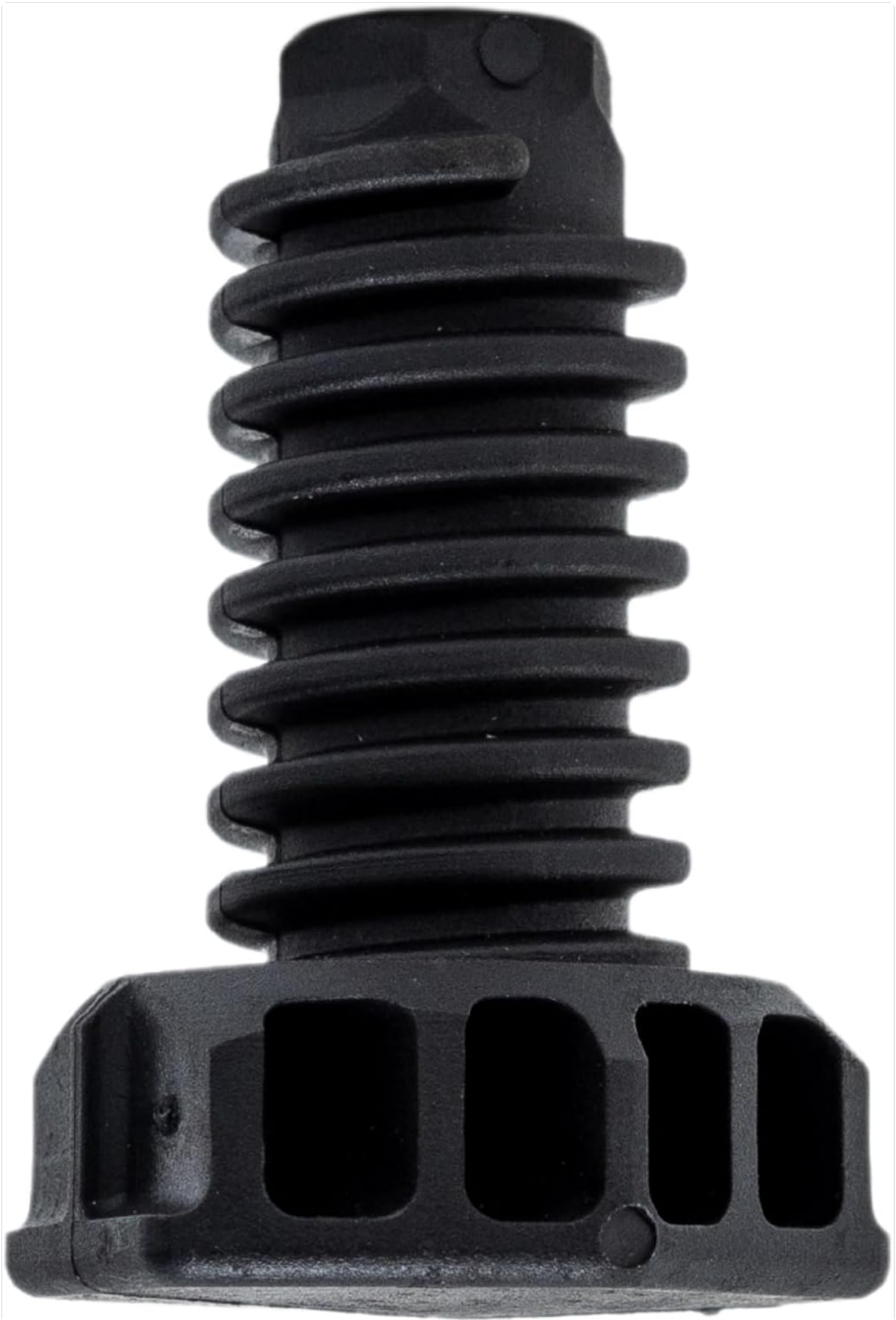
Image: The Frigidaire 216396900 Adjustable Foot Leveling Leg, showcasing its threaded shaft and sturdy base.