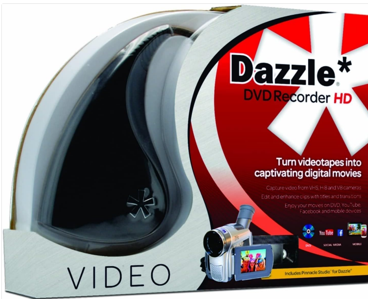
Figure 1: Dazzle DVD Recorder HD product packaging, showcasing the device and its capabilities.

The Dazzle DVD Recorder HD is a video capture device designed to convert analog video sources into digital formats. It allows users to capture video from various sources such as VHS, Hi8, and V8 cameras, game systems, and DVD players. The included software, Pinnacle Studio for Dazzle, provides tools for editing, adding titles and transitions, and creating movies for DVD, web, and popular devices.