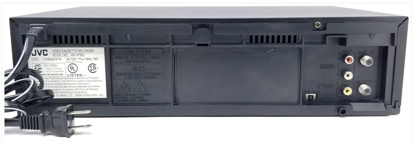
Figure 3: Rear panel of the JVC HR-VP58U VCR, displaying the power cord, serial number, and various audio/video input/output ports.