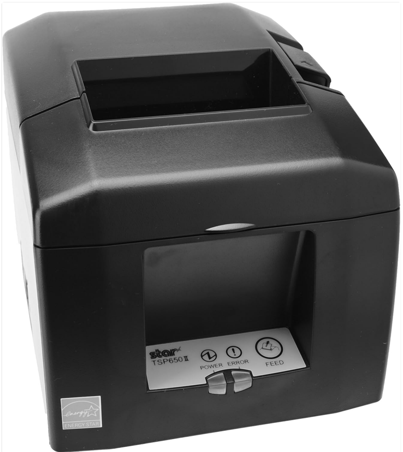
Figure 1: Front view of the Star Micronics TSP650II BTi Receipt Printer, showing the paper output slot and control buttons (Power, Error, Feed).