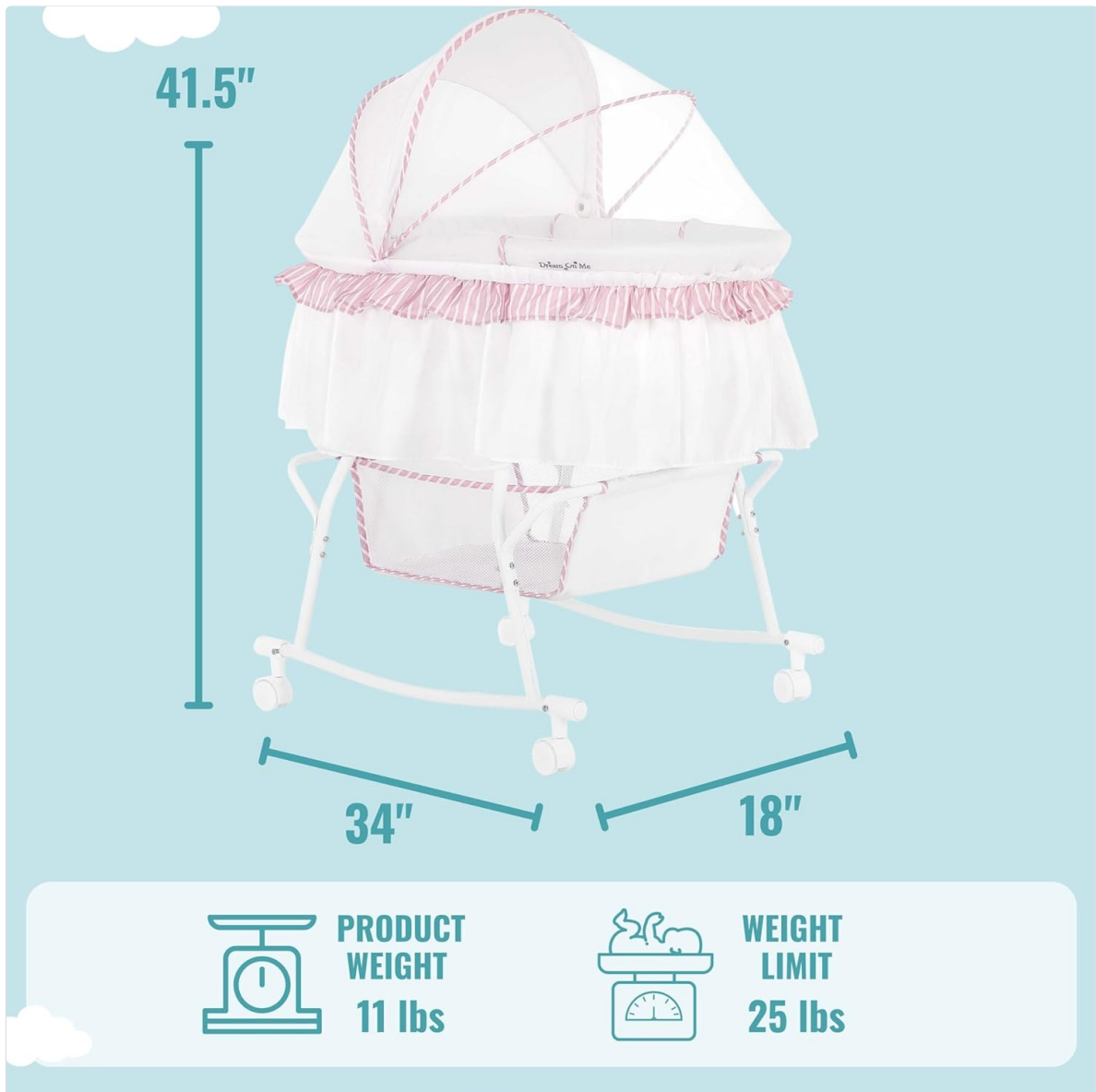
Image: Product specifications including overall dimensions (34"L x 18"W x 41.5"H), product weight (11 lbs), and weight limit (25 lbs).