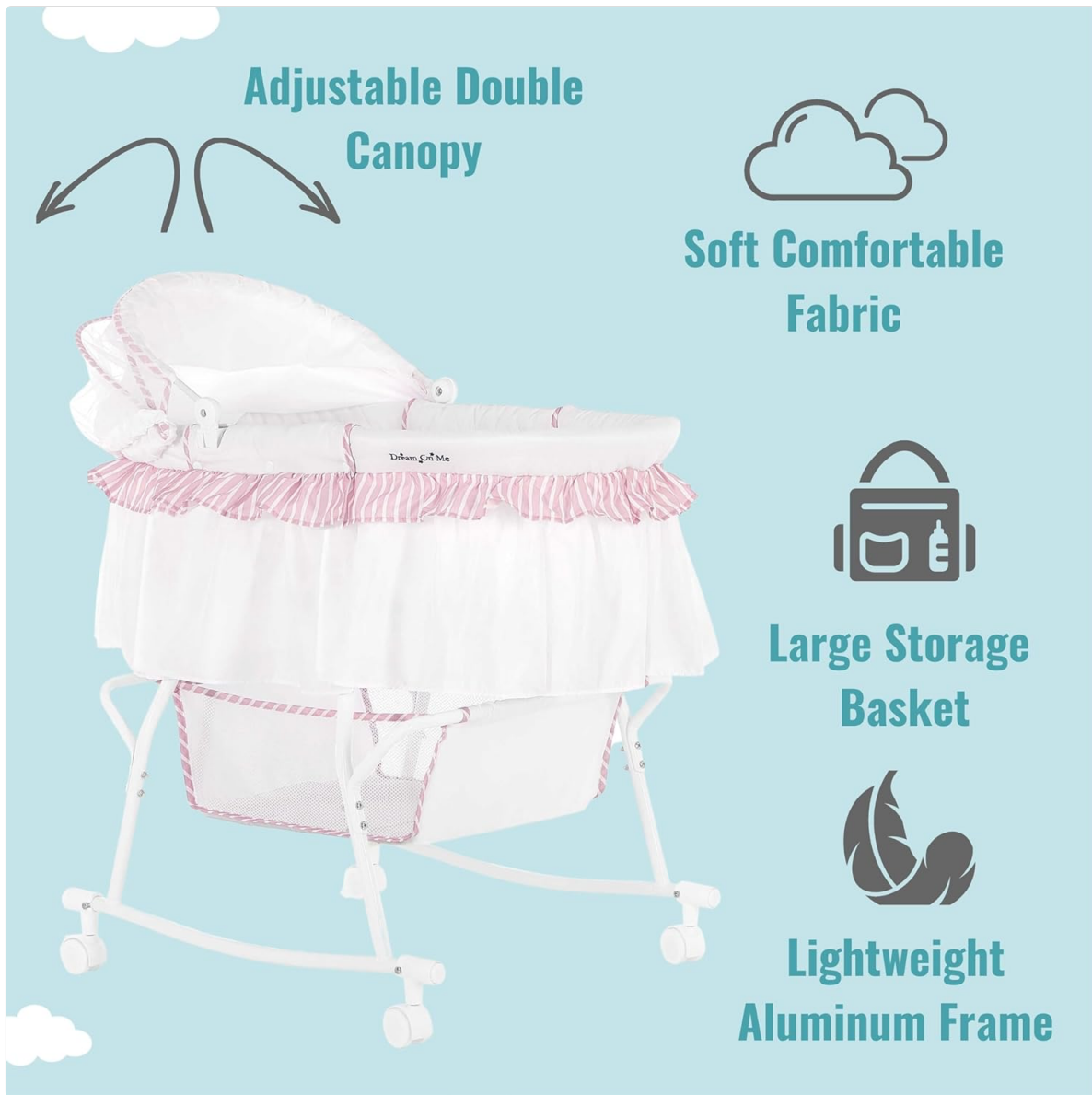
Image: Key features of the bassinet, including the adjustable double canopy, soft comfortable fabric, large storage basket, and lightweight aluminum frame.