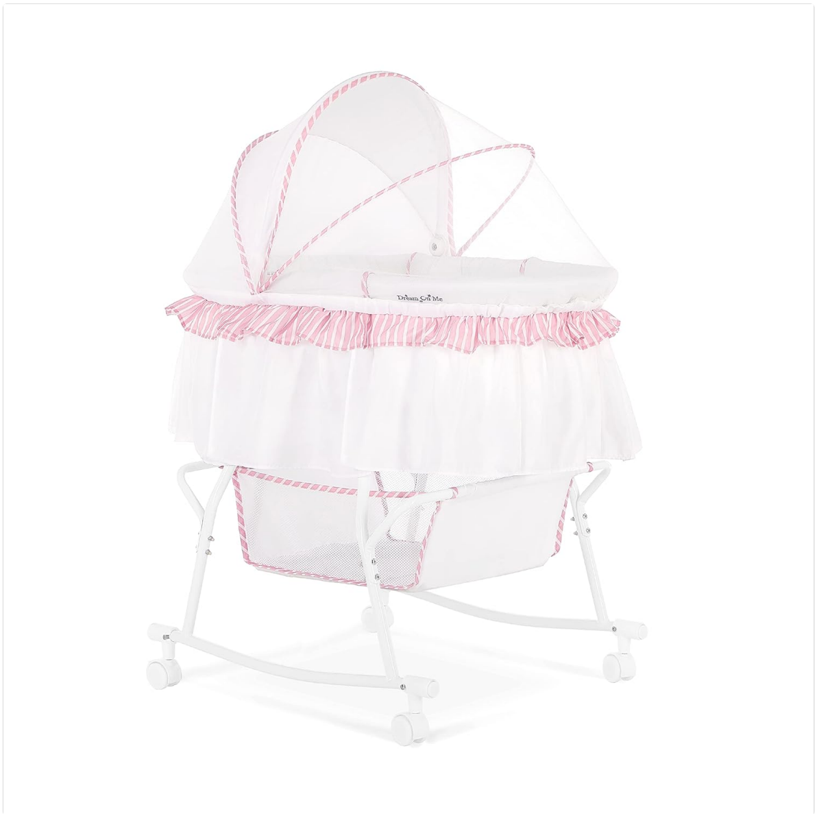
Image: Fully assembled Dream On Me Lacy Portable 2-in-1 Bassinet & Cradle with canopy extended, showcasing its design and features.