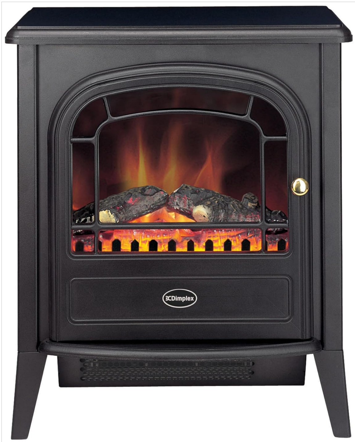
Figure 4: Optiflame Log Effect. This image displays the realistic flame and ember effect of the electric stove.