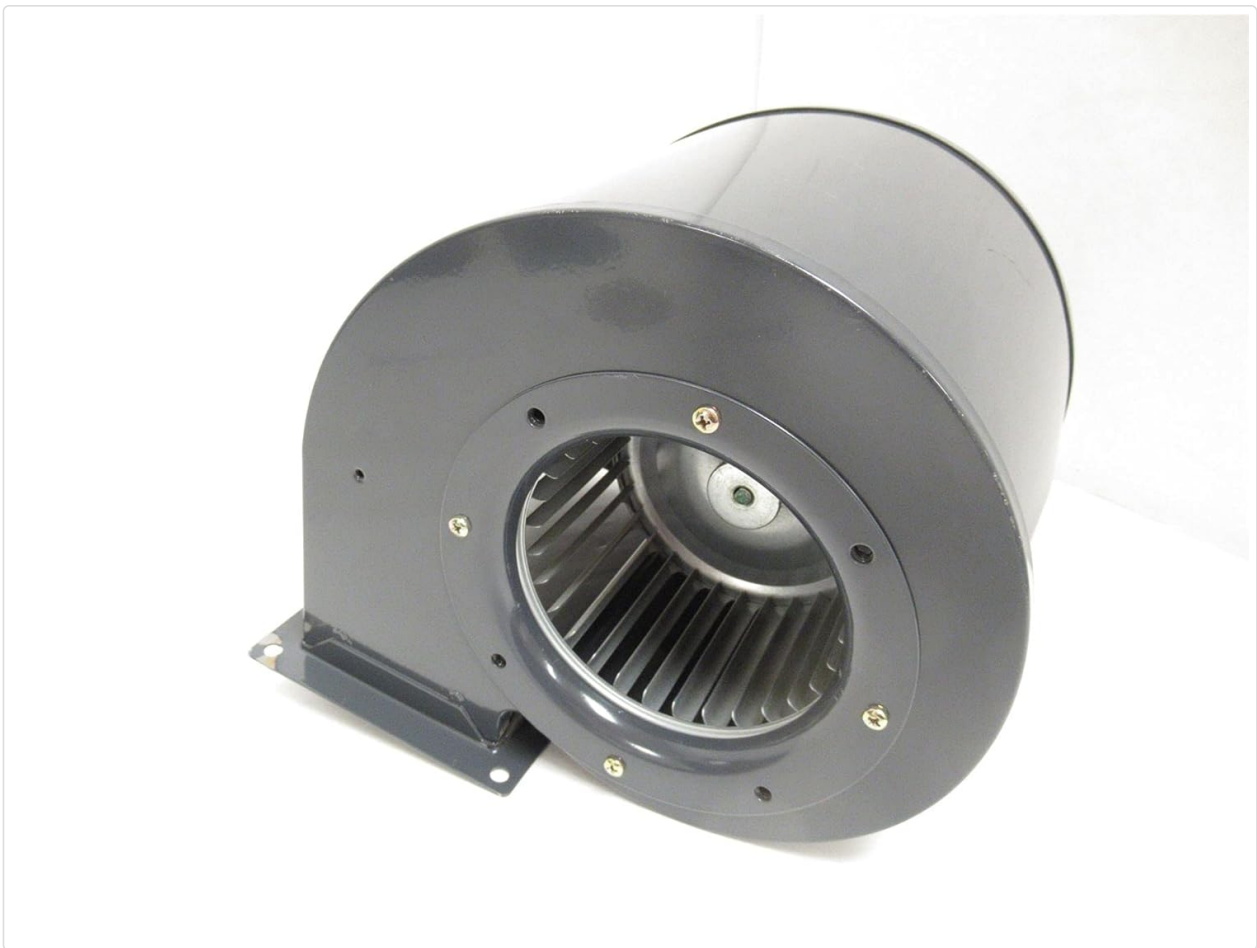
Figure 3.4: View of the blower's circular air inlet, showing the forward-curve wheels inside.