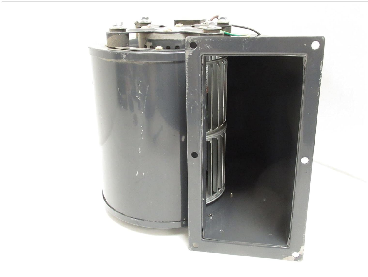
Figure 3.3: View of the blower's rectangular outlet, designed for specific ducting or mounting applications.