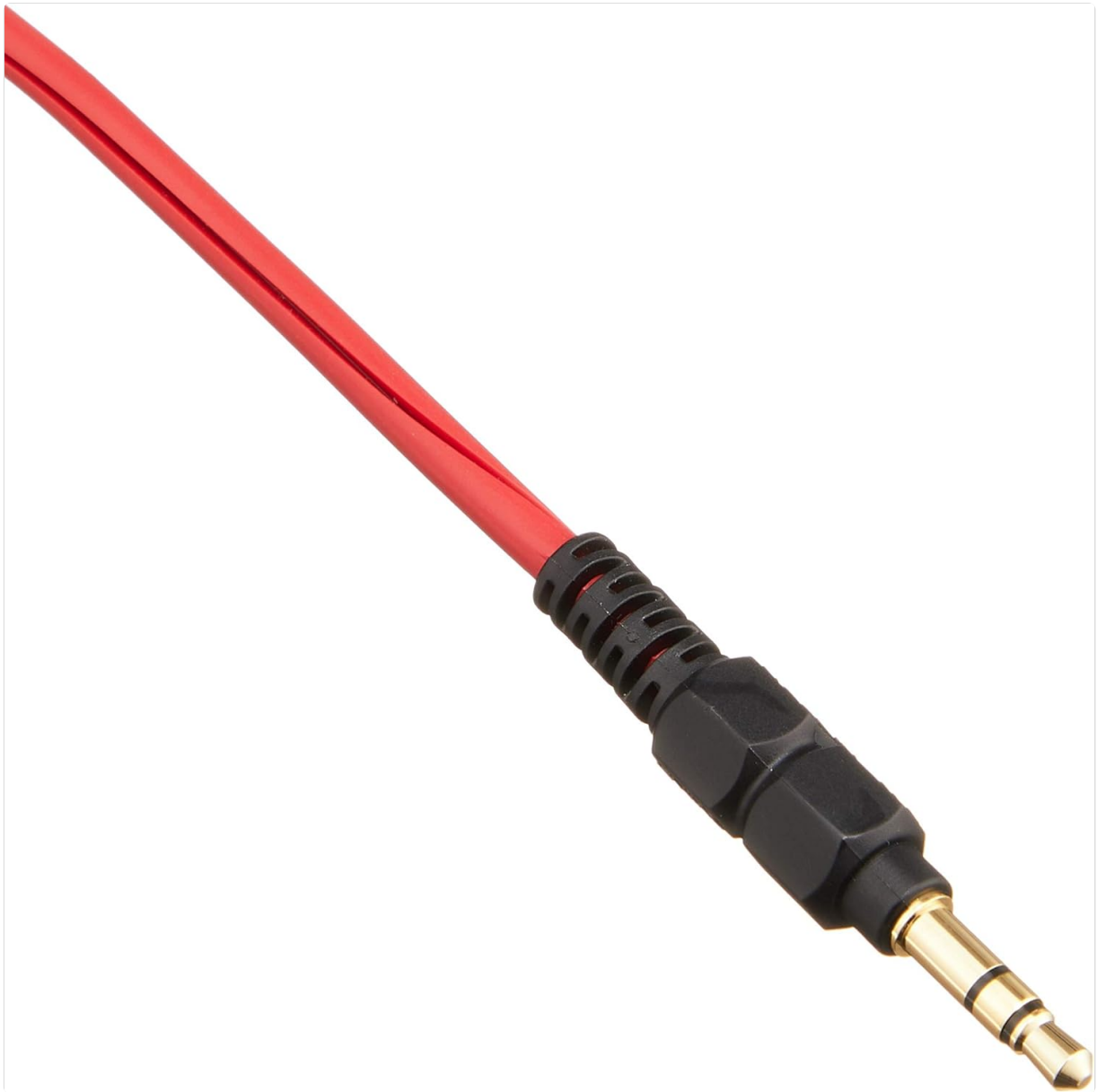
Detail of the 24K gold-plated 3-pole stereo mini plug, designed for optimal audio signal transmission.