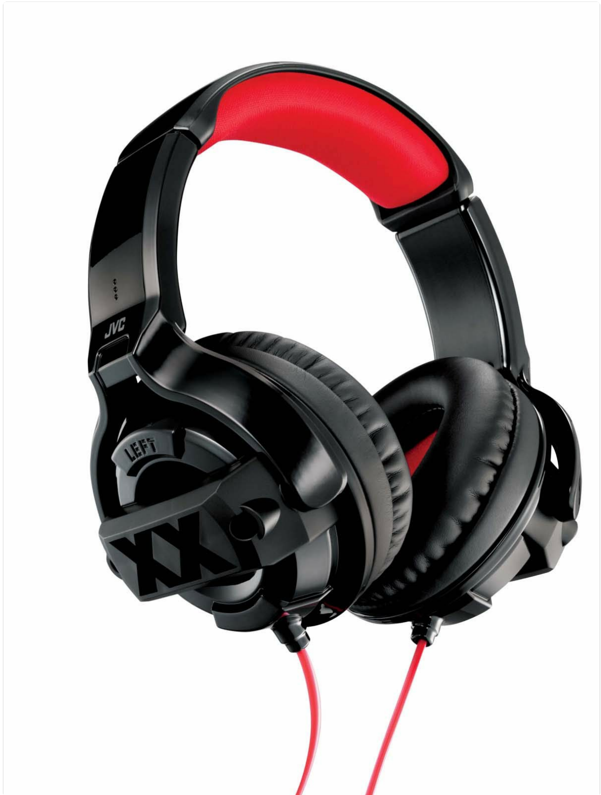
Front view of the JVC HA-XM20X XX Series Sealed Headphones, showcasing the black earcups and red headband padding.

Familiarize yourself with the components and features of your JVC HA-XM20X headphones.