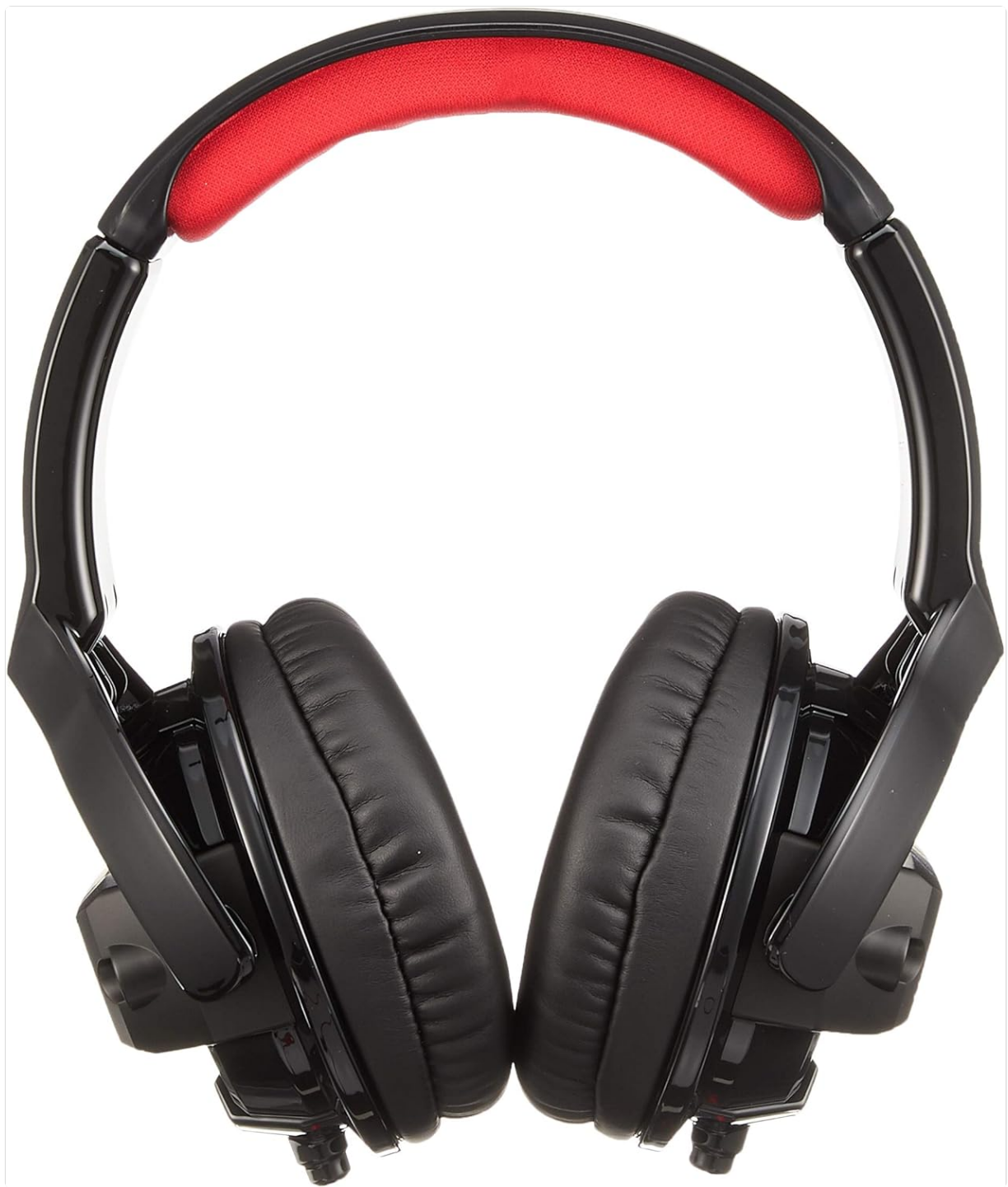
An angled view of the JVC HA-XM20X headphones, highlighting the robust design and earcups.