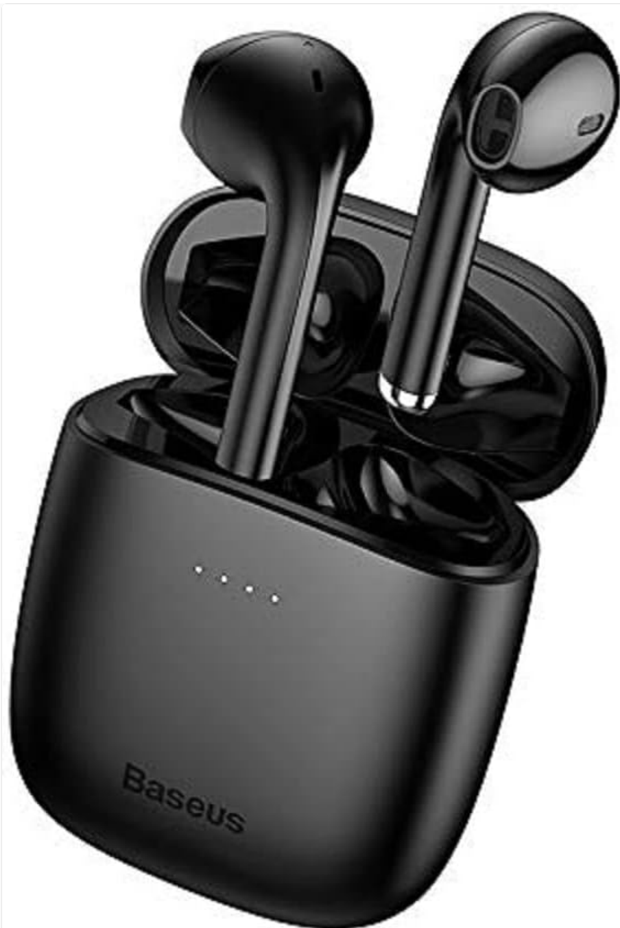
Figure 1: Baseus Encok W04 Earphones and Charging Case. The image displays the black earbuds securely placed within their matching black charging case, which is open to reveal the earbuds and the LED battery indicators on the front.