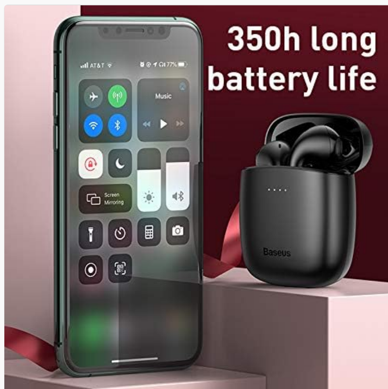
Figure 5: Battery Life Indication. This image shows the charging case alongside a smartphone screen, visually representing the