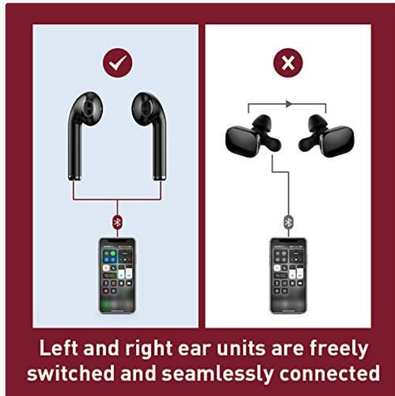
Figure 3: Earbud Connectivity Options. This diagram illustrates the flexible connectivity of the earbuds, showing how both left and right units can be used independently or together, seamlessly switching between mono and stereo modes.