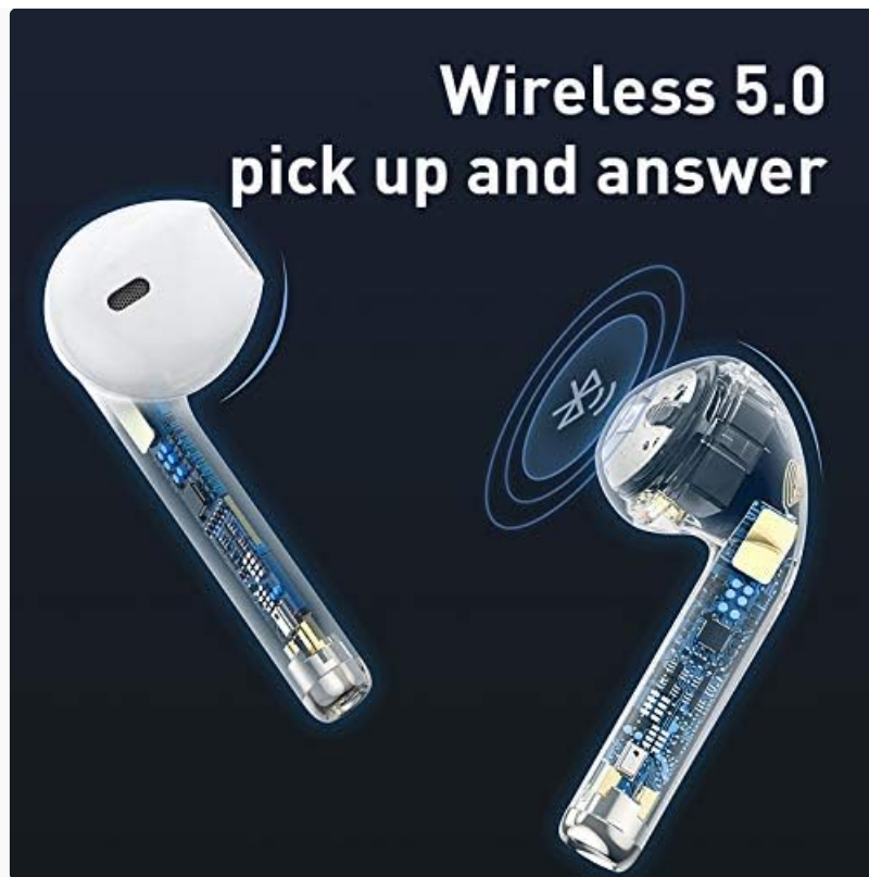
Figure 2: Internal Structure of the Earbuds. This image provides a transparent view of the earbud's internal circuitry, emphasizing its wireless communication technology, specifically Bluetooth 5.0 capabilities for seamless connection and audio transmission.