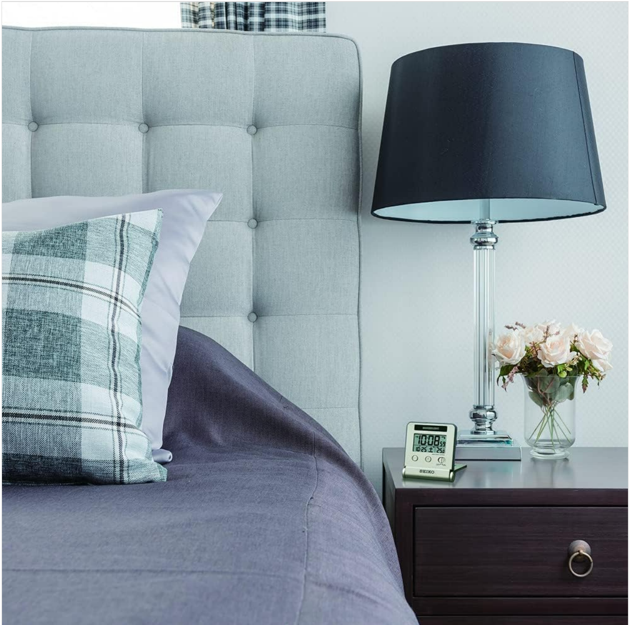
Image: The Seiko SQ772G clock positioned on a nightstand next to a bed. This image demonstrates the clock's compact size and how it integrates into a typical bedroom environment, highlighting its suitability as a bedside companion.