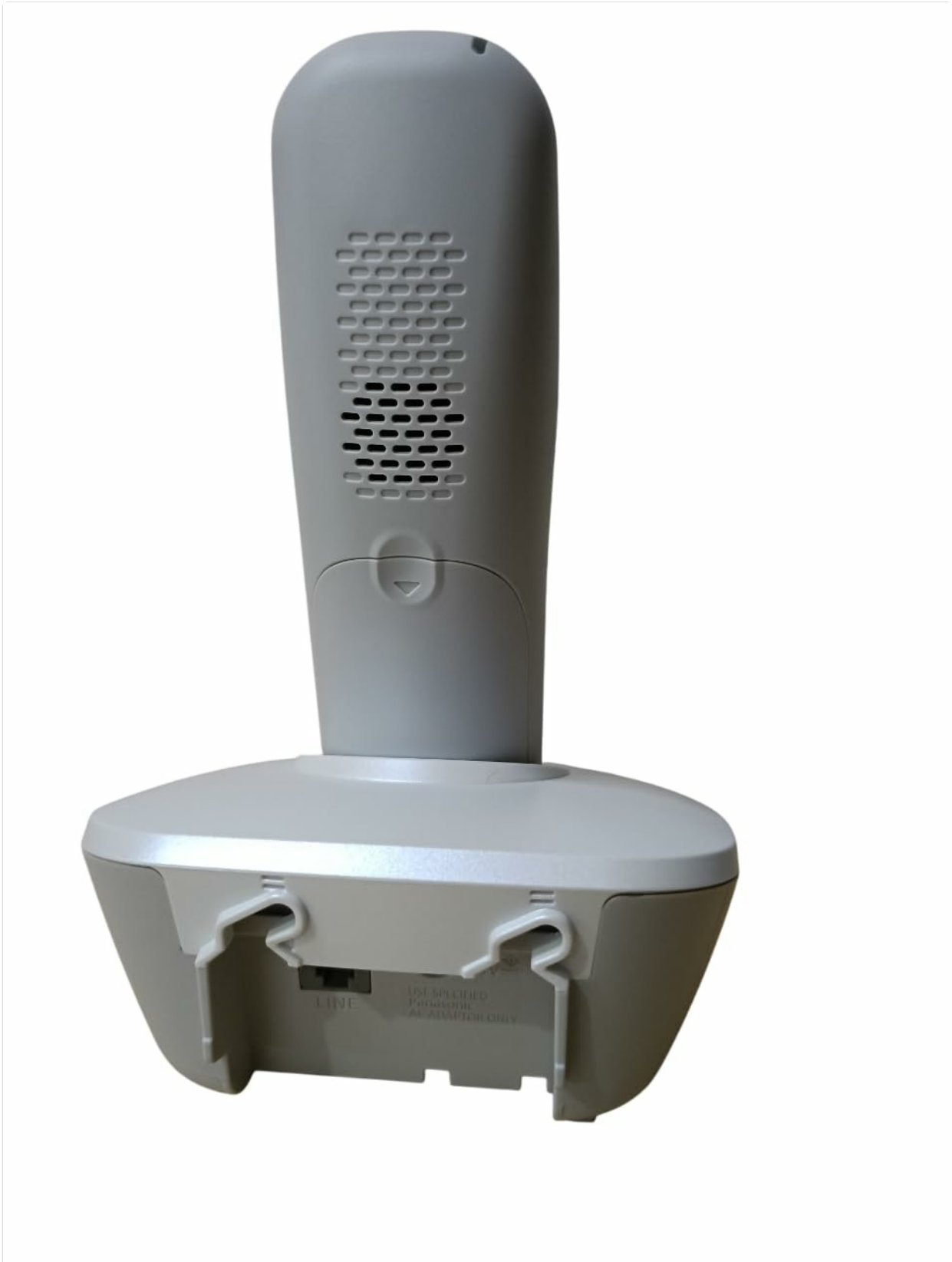
Figure 3: Base Unit Rear View with Wall Mount Slots

The base unit can be mounted on a wall. Use the provided wall mounting bracket or integrated slots on the base unit to secure it to a wall using two screws (not supplied).