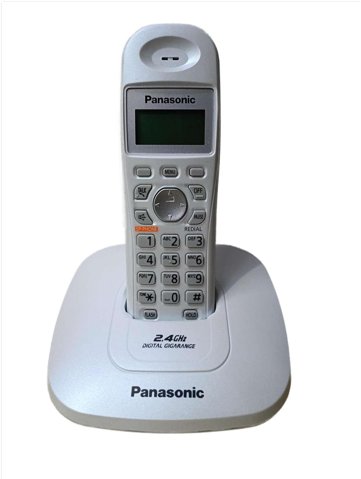
Figure 1: Panasonic KX-TG3611SX Handset and Base Unit

This image displays the Panasonic KX-TG3611SX cordless phone, featuring the handset docked in its white base unit. The handset has an alphanumeric keypad, a display screen, and various function buttons. The base unit is compact and designed to hold the handset securely.