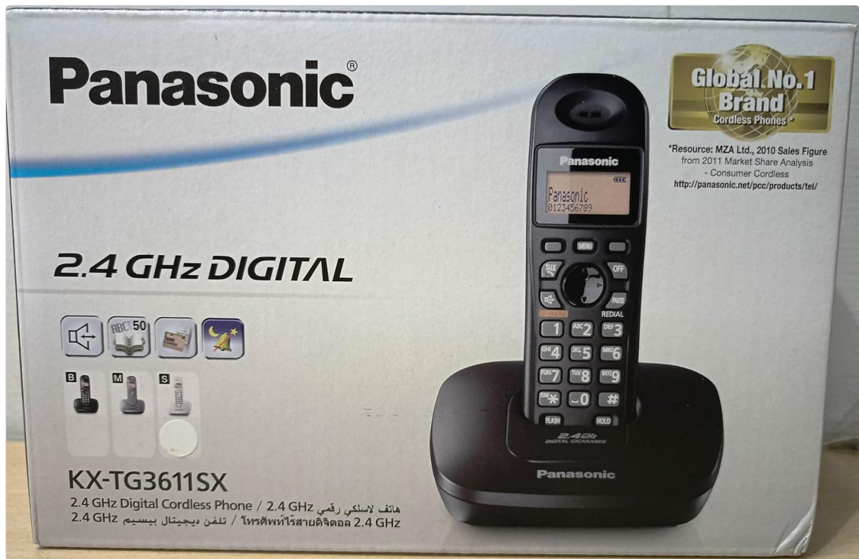
Figure 2: Product Packaging

This image shows the retail box for the Panasonic KX-TG3611SX cordless phone, indicating the model number and key features like 2.4 GHz Digital technology.