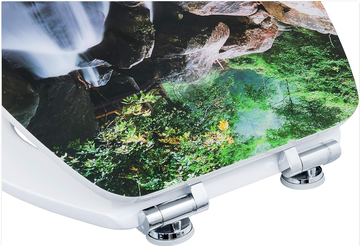
Image: A close-up view of the chrome soft-close hinges and the detailed waterfall pattern on the toilet seat lid.