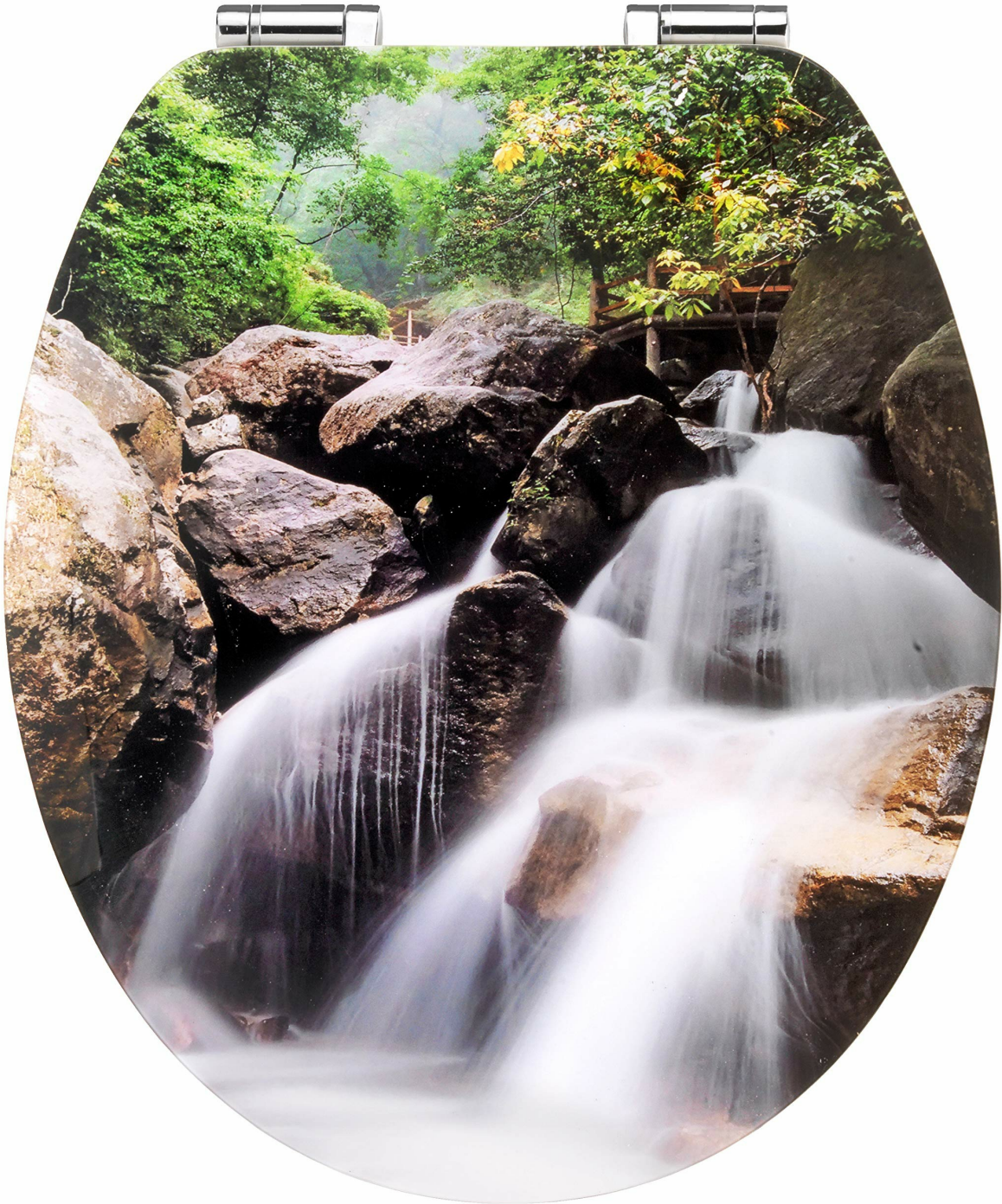
Image: The CORNAT KSDSC323 WC-seat, showcasing its multicoloured waterfall design on the lid and white seat base with chrome hinges.