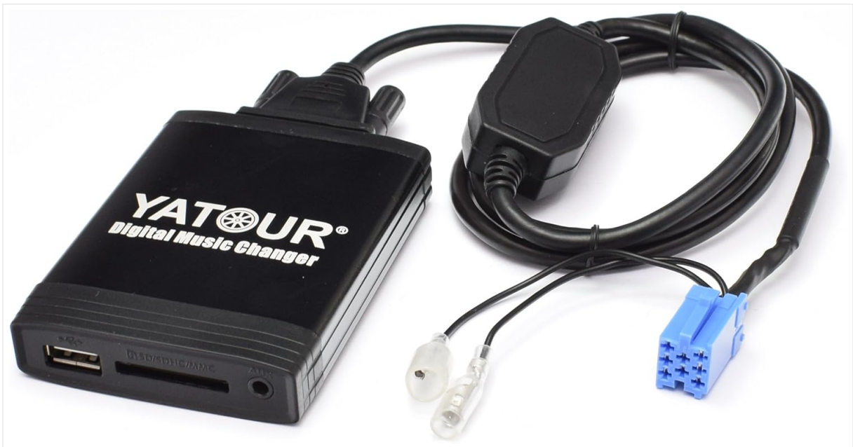
Figure 1: The Yatour YTM06-RD3 Digital Music Changer unit, showing the main module, USB, SD, and AUX ports, and the connection cables with the blue mini-ISO connector.