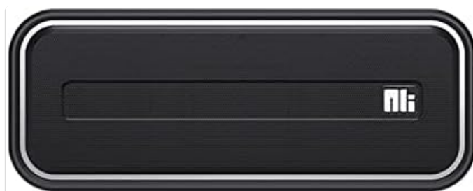
Front view of the Nillkin Traveler W2 wireless speaker, showcasing its minimalist design.