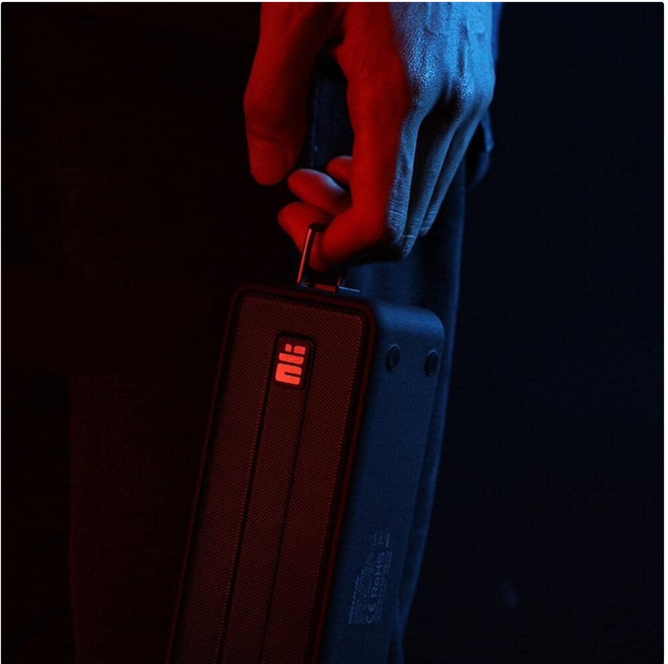
A hand holding the Nillkin Traveler W2 speaker, showcasing its compact design and side controls/ports.