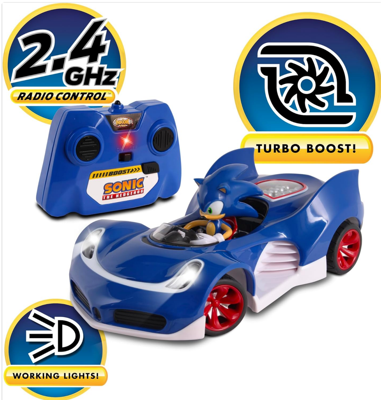
Figure 2: The NKOK RC Sonic SSAS R2 Car and its accompanying remote control. The remote features dual joysticks and a "BOOST" button, while the car displays working headlights.