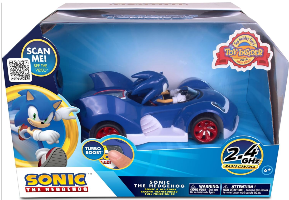
Figure 1: The NKOK RC Sonic SSAS R2 Car and its remote control, as seen in the retail packaging. The packaging highlights features like 2.4 GHz radio control, turbo boost, and working lights.