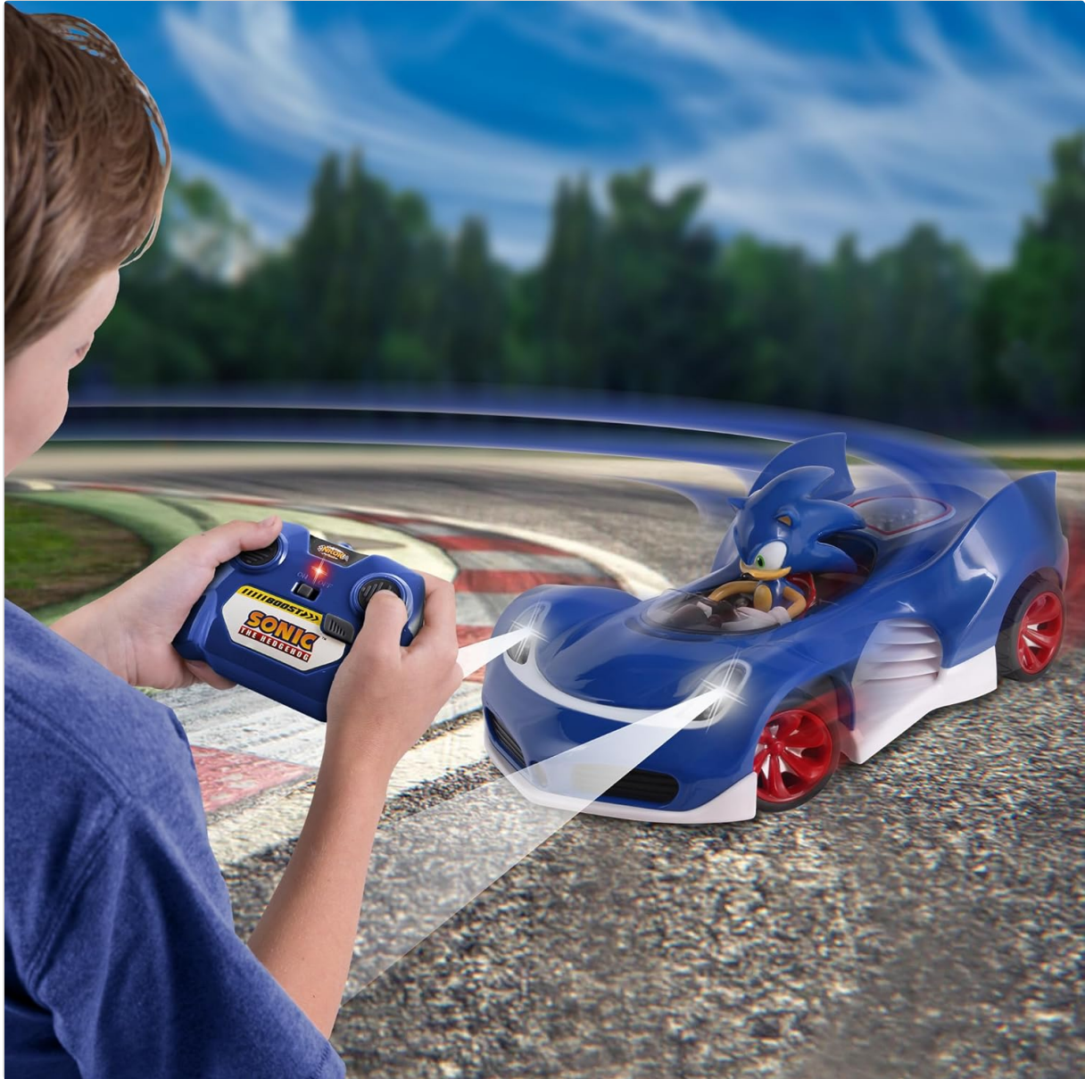
Figure 3: A child is shown operating the NKOK RC Sonic SSAS R2 Car with its remote control on a simulated race track, demonstrating the car's working headlights.

For a visual demonstration of the car's operation, you may refer to this external video NKOK Sonic All-Star Racing Car Demo .