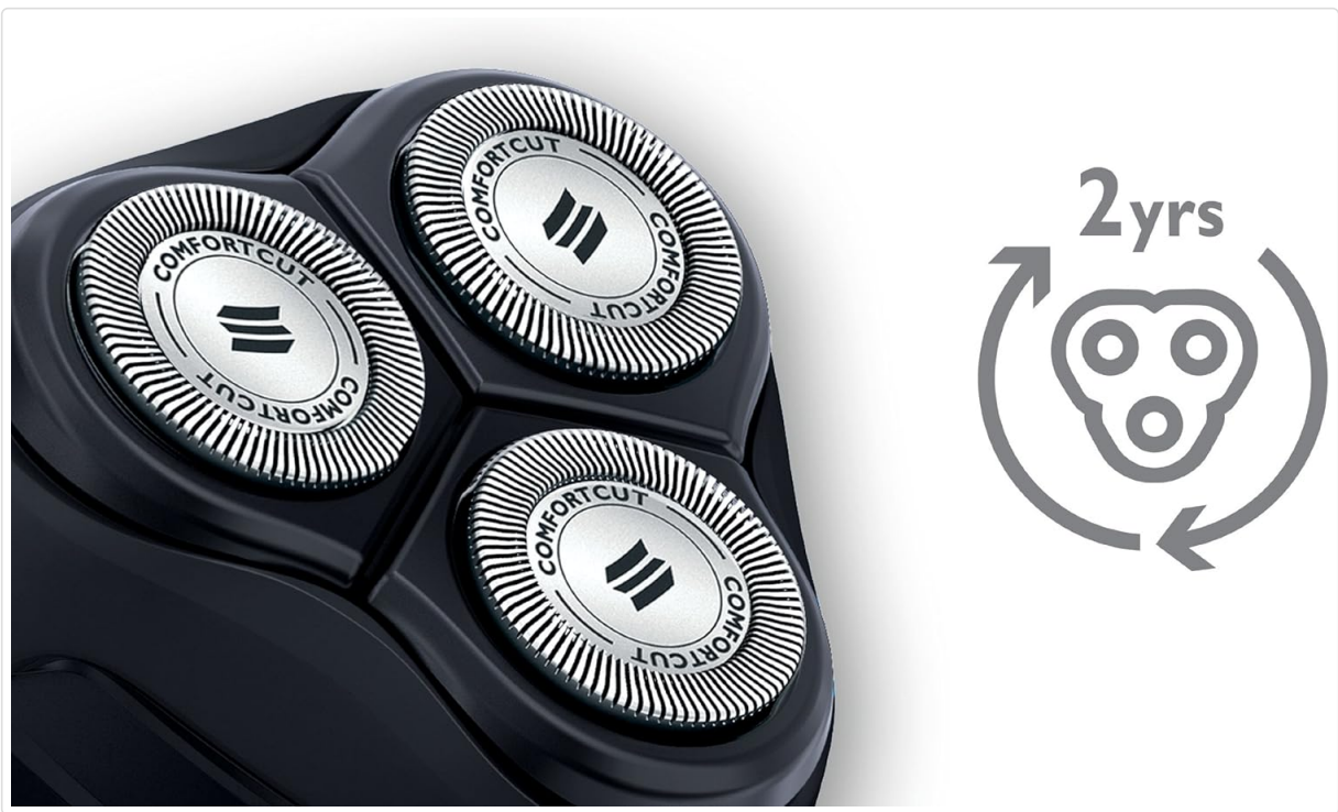
Image: Close-up of the ComfortCut blades with an icon indicating a recommended replacement every 2 years.