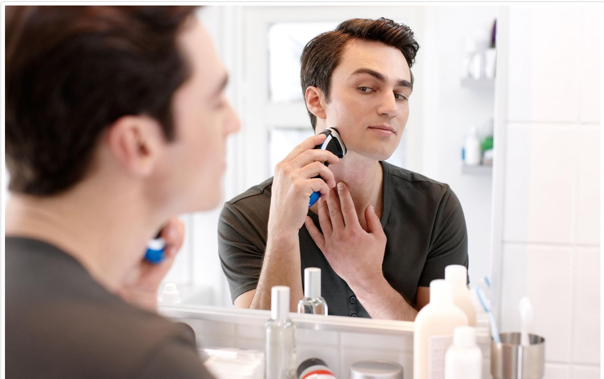
Image: A man using the Philips AquaTouch AT899/16 electric shaver on his face.