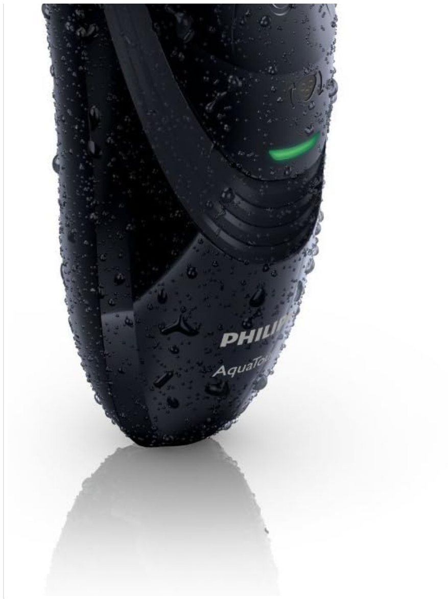
Image: The Philips AquaTouch AT899/16 shaver covered in water droplets, illustrating its wet-use capability.