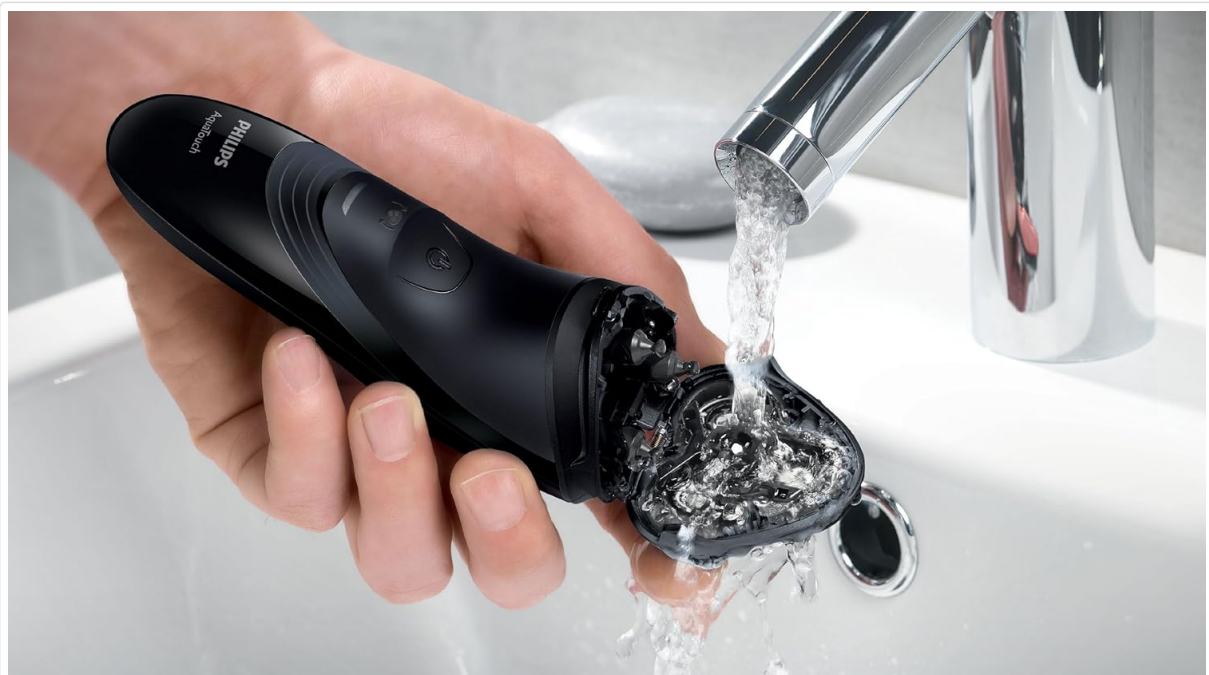
Image: The Philips AquaTouch AT899/16 shaver head being rinsed under running water for cleaning.