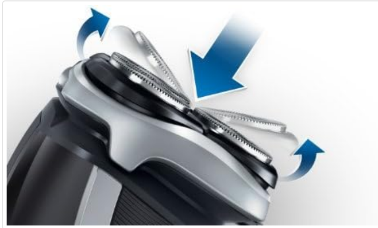
Image: Close-up of the shaver head demonstrating its flexing capability to adapt to facial contours.