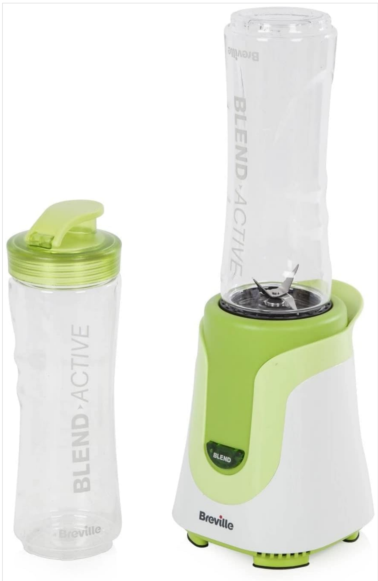
This image displays the Breville Blend Active VBL062 Personal Blender. It features the white and green motor base with a clear blending bottle attached, showing the blade assembly inside. A second clear blending bottle with a green lid is shown alongside.