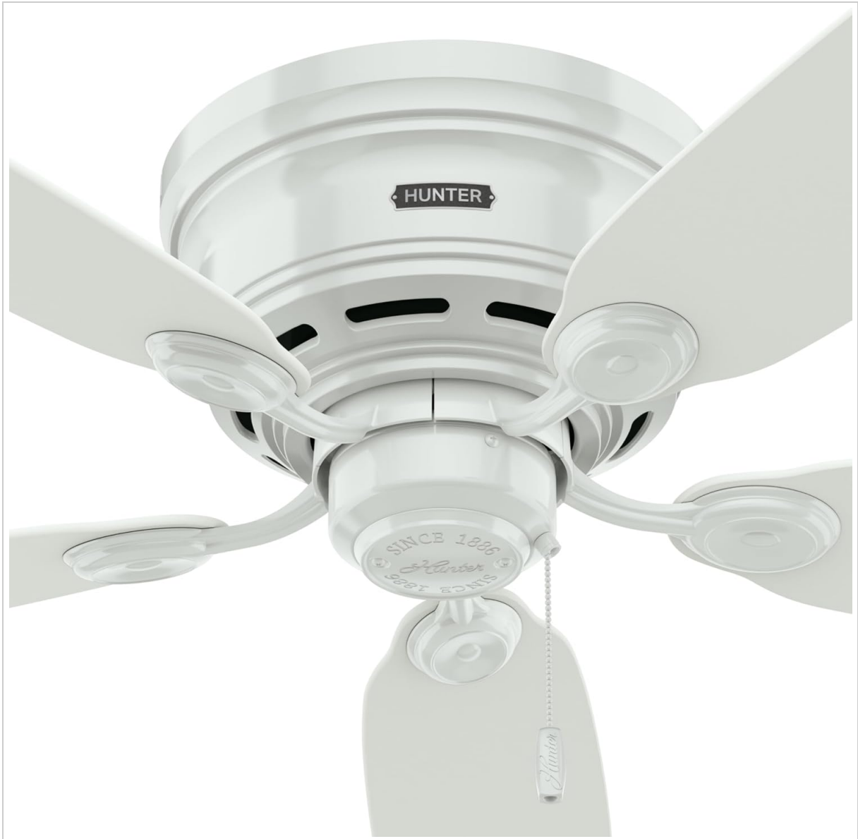
Figure 1: Components of the Hunter Low Profile IV Ceiling Fan, including the motor, five reversible blades, and pull chain control.