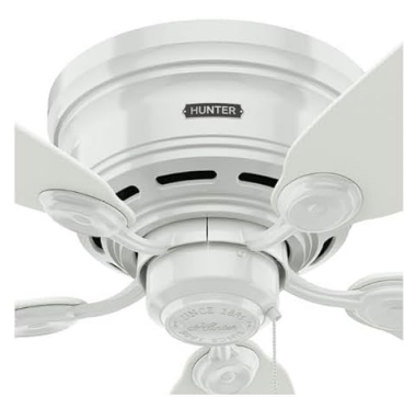
Figure 3: The Hunter Low Profile IV 51059 fan installed, showcasing its flush mount design and five white blades.