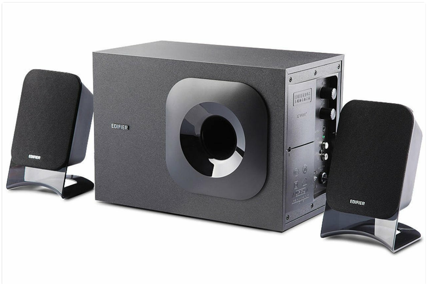
Image: The complete Edifier M1370BT 2.1 speaker system, showing the central subwoofer unit and the two satellite speakers positioned on either side.