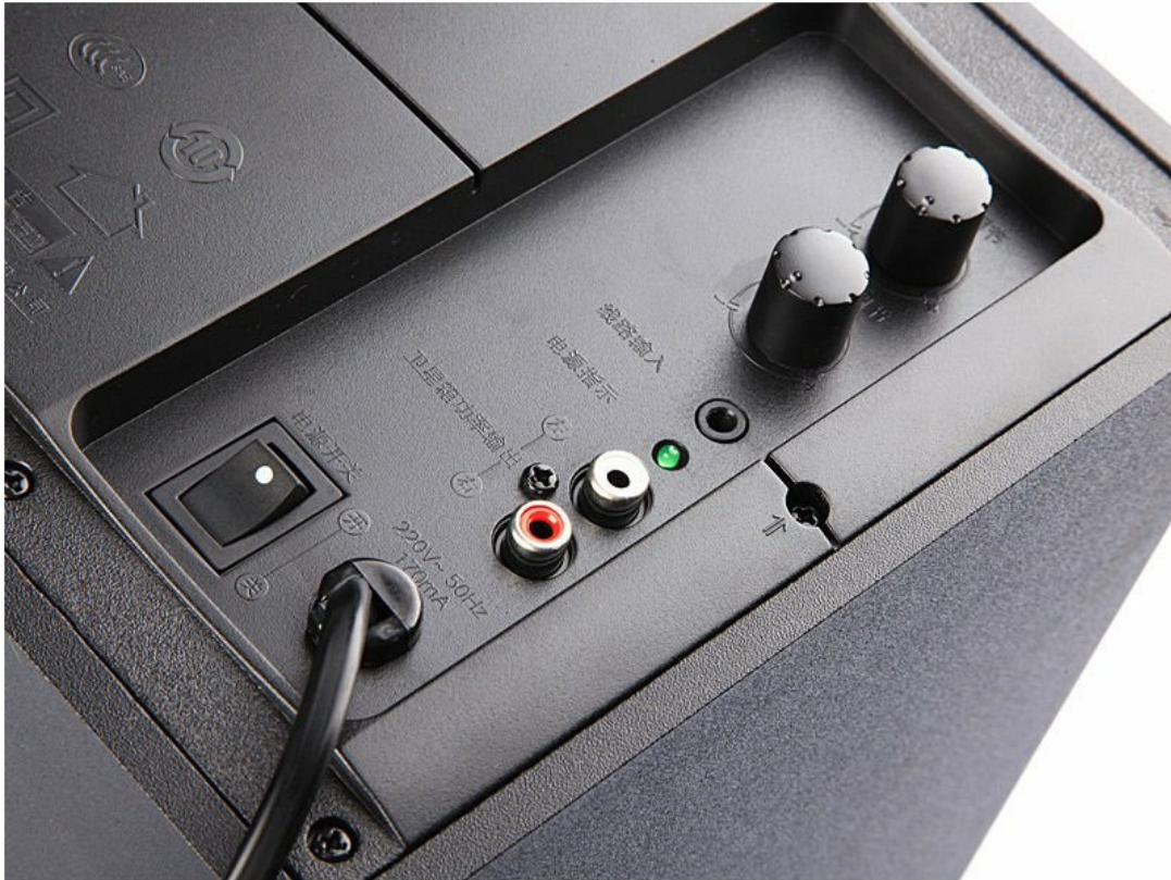
Image: The rear panel of the Edifier M1370BT subwoofer, displaying the power switch, audio input ports (3.5mm and RCA), and volume/bass control knobs.