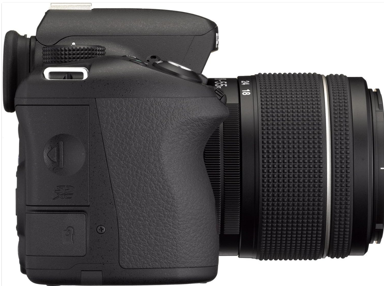
Figure 2: Right side view of the Pentax K-50, illustrating the memory card compartment.