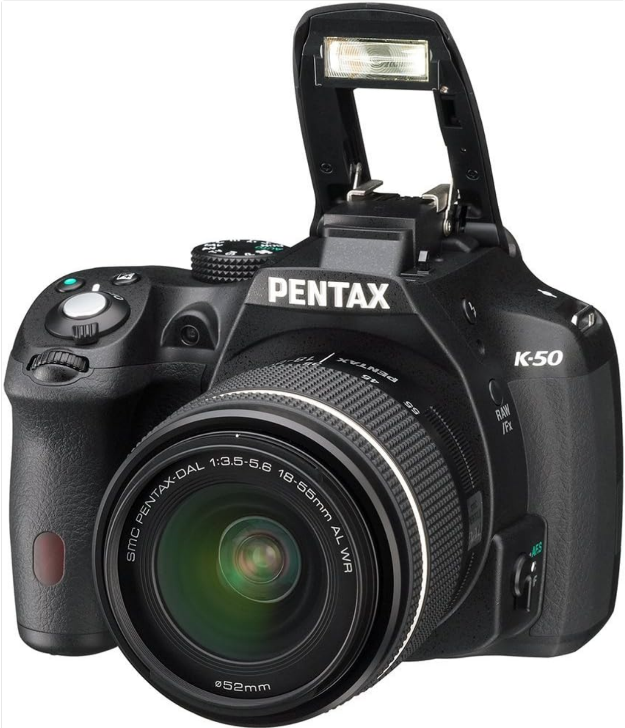
Figure 4: Pentax K-50 with the built-in flash activated.

The K-50 features a built-in pop-up flash. In Auto Picture mode, the flash may deploy automatically in low light. For manual control, press the flash button to raise the flash. Flash modes include Auto, On, Off, Slow Synch, and Rear Curtain Synch.