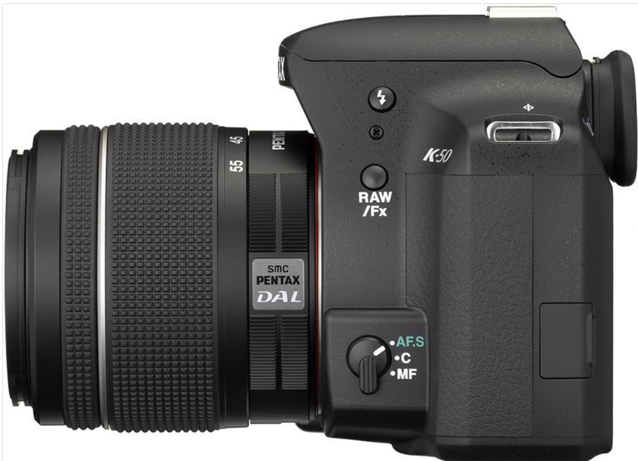
Figure 3: Left side view of the Pentax K-50, highlighting the AF mode selector.