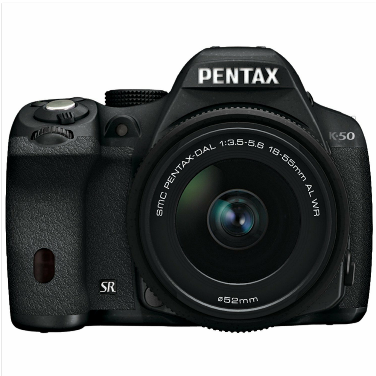
Figure 1: Front view of the Pentax K-50 camera with the DA L 18-55mm WR lens.