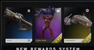
NEW REWARDS SYSTEM

Pure, skill-based 8-player competitive combat.