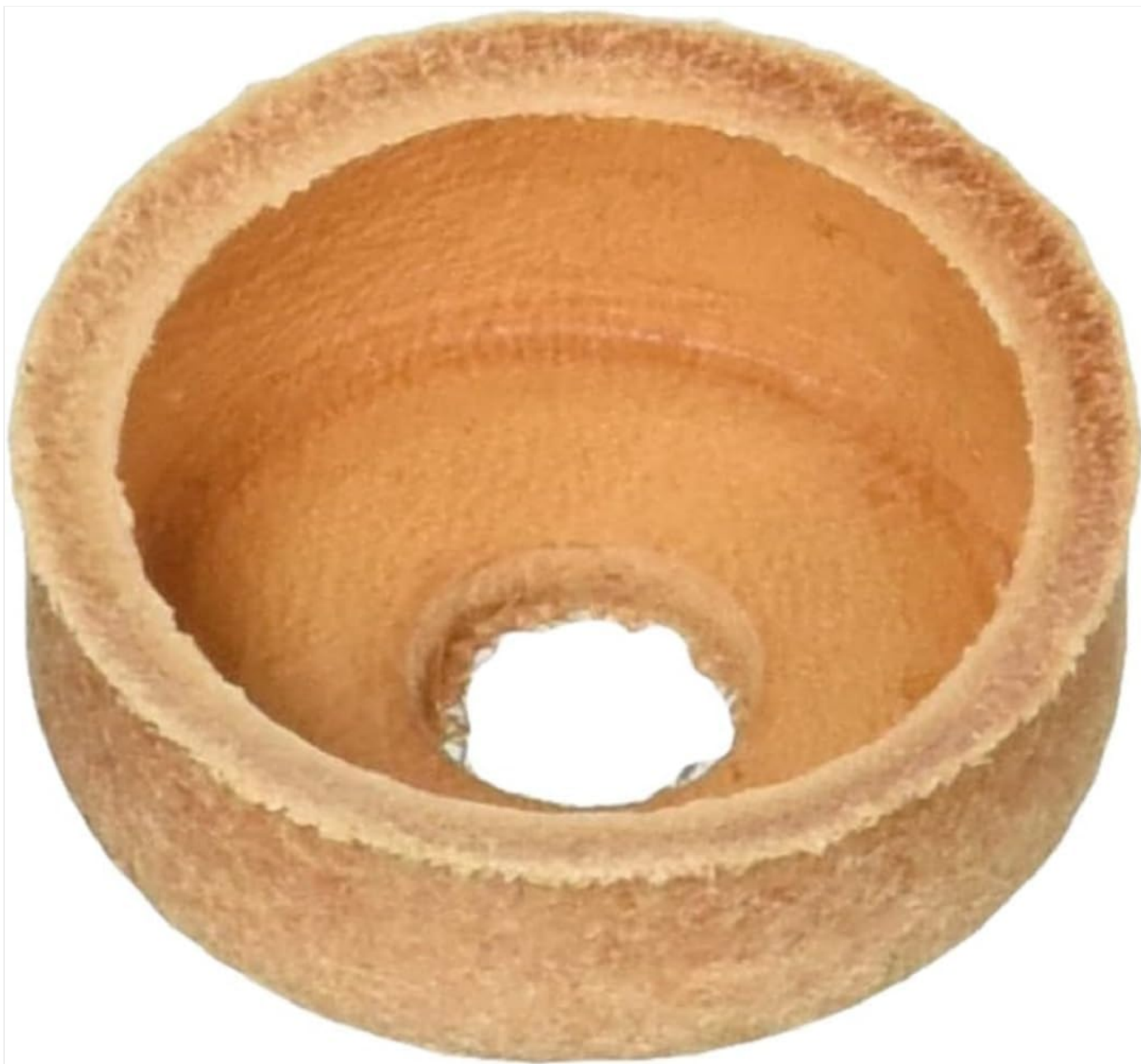
Image 1.1: Top view of the SILCA 731 Leather Washer, showing its circular shape and central opening.