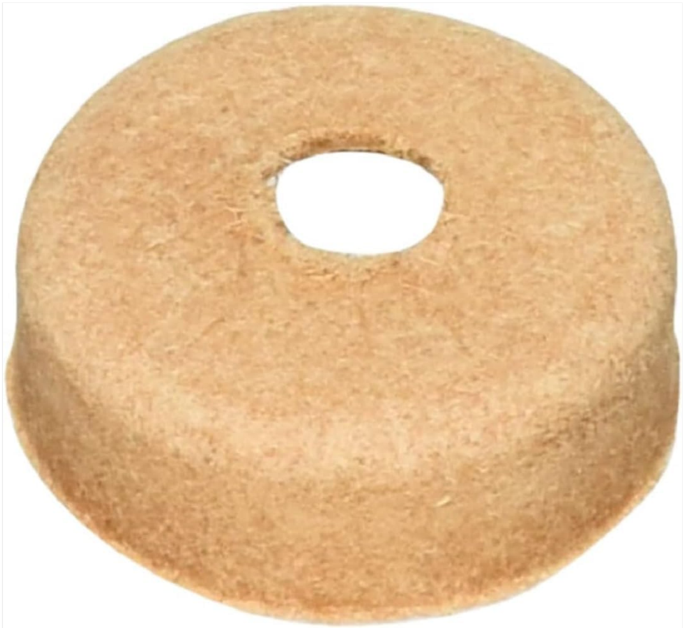
Image 3.1: Side view of the SILCA 731 Leather Washer, illustrating its conical shape designed for sealing.