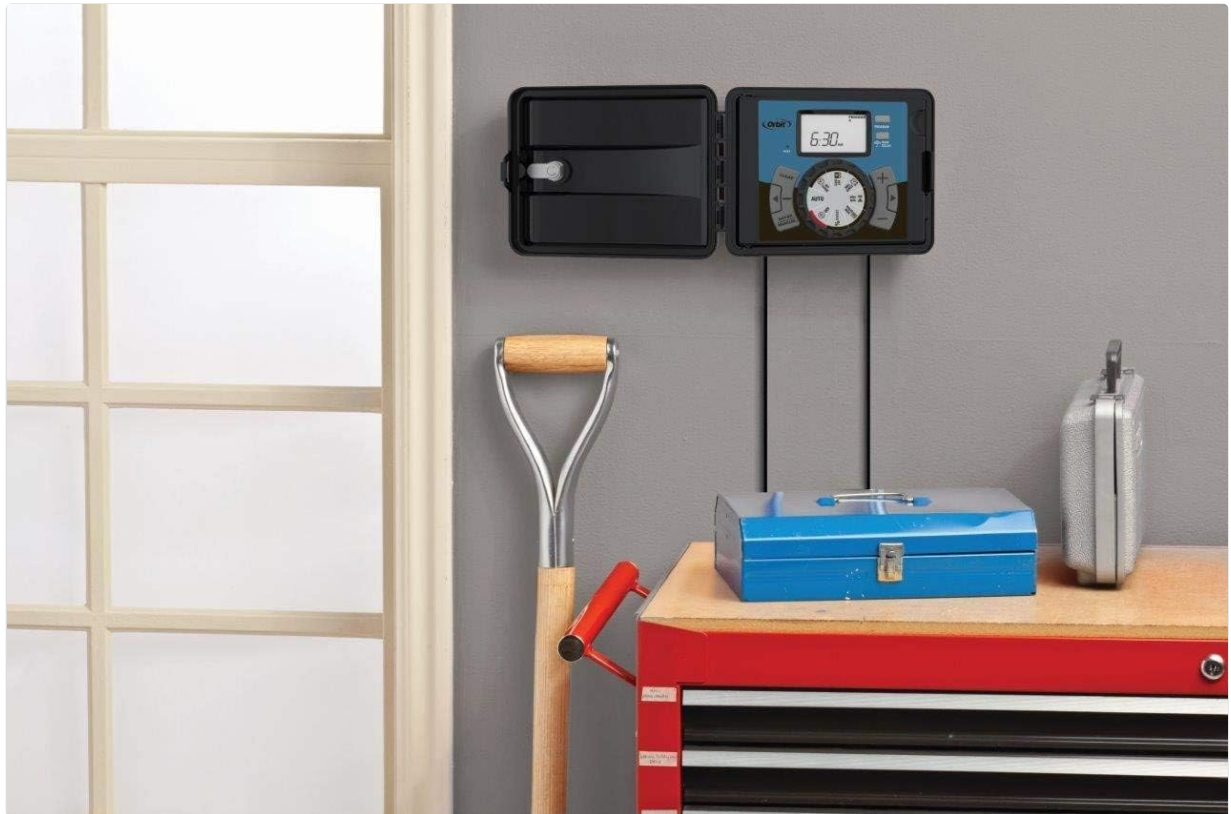
Image: The Orbit Easy 9 timer mounted on a garage wall, demonstrating an indoor installation. The timer is positioned above a workbench with tools.

The Orbit Easy 9 timer can be mounted indoors or outdoors. Choose a location near a power outlet and away from direct sunlight or extreme weather conditions. Ensure the mounting surface is stable.