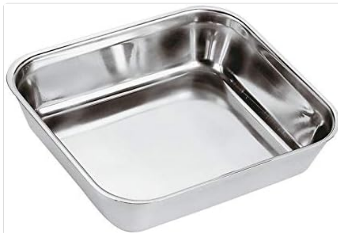
Image 1: PADERNO Stainless Steel Container. This image displays the rectangular stainless steel container with smooth, polished surfaces and gently rounded corners, indicating its robust construction and suitability for kitchen use.

The PADERNO Stainless Steel Container is designed for professional cooking and various kitchen applications. Crafted from high-quality stainless steel, it offers durability and ease of cleaning.