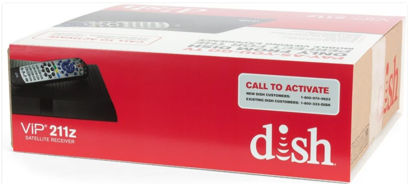
Image: The retail packaging for the DISH ViP 211z Satellite Receiver, showing the receiver and remote on the box, along with "CALL TO ACTIVATE" information.