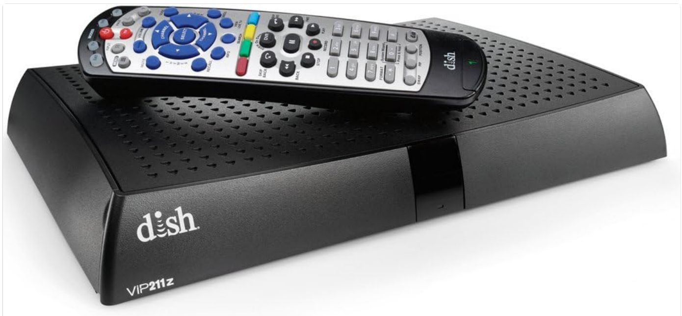
Image: The DISH ViP 211z HD Receiver shown with its accompanying universal IR remote control resting on top.