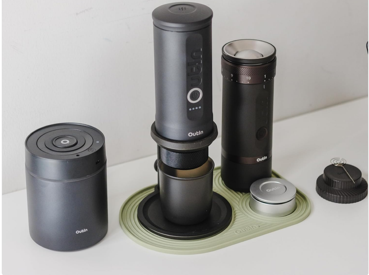
Image 2.1: The mat provides a stable and slip-resistant surface for coffee equipment.