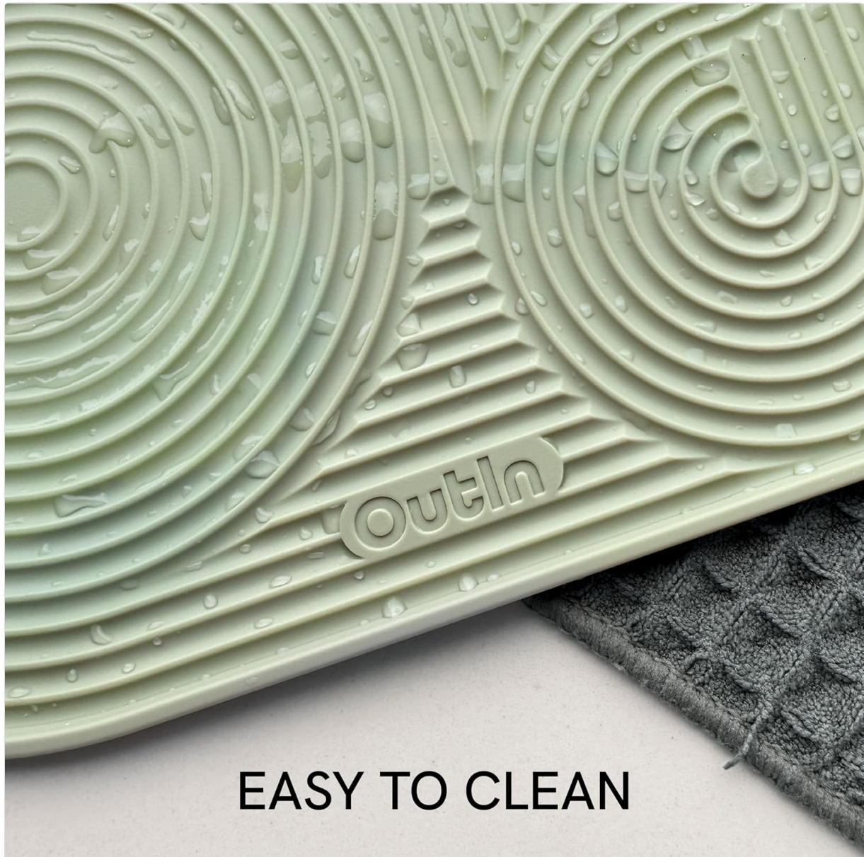
Image 5.1: The mat's smooth silicone surface allows for easy cleaning.