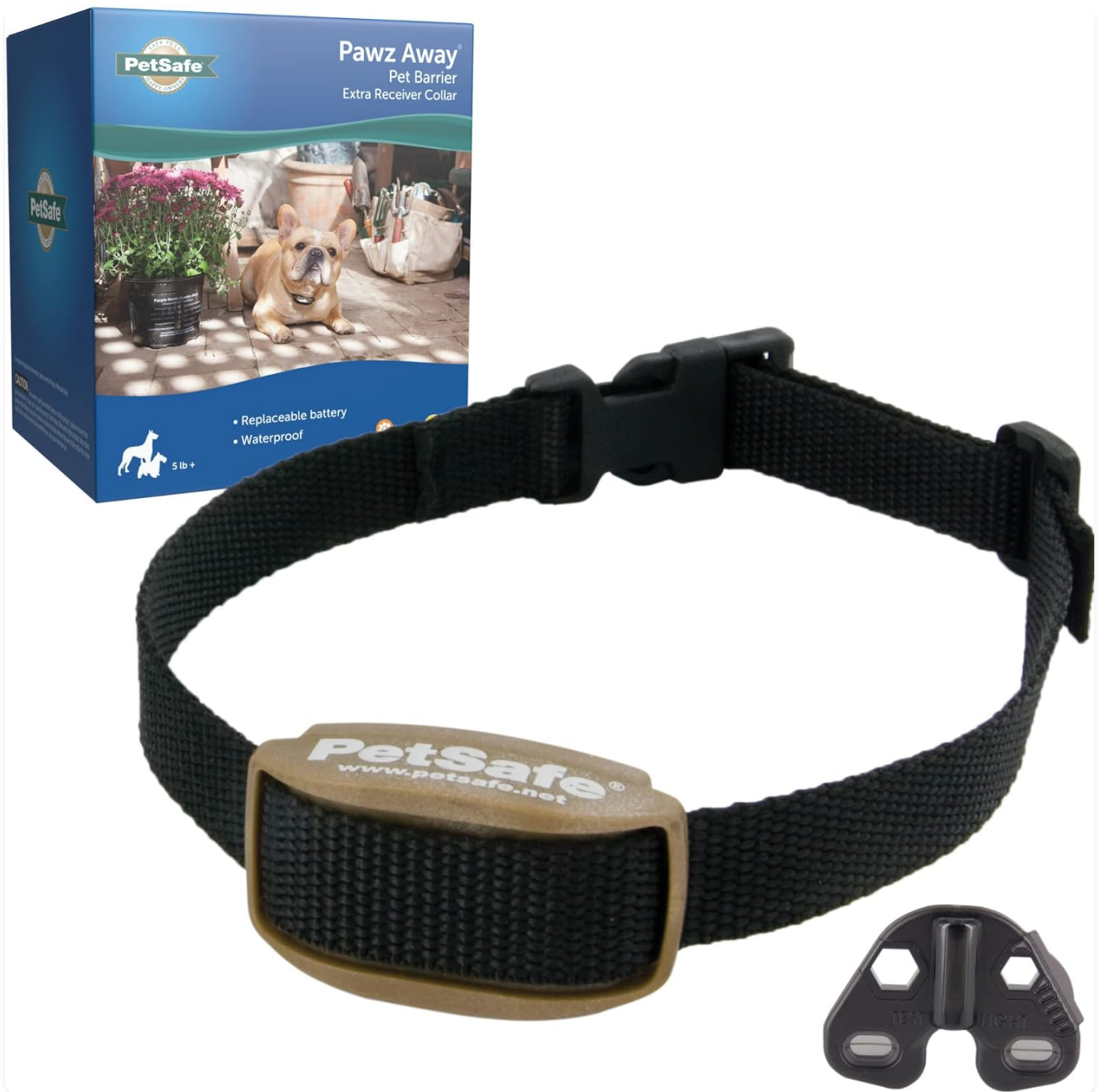
Image: The PetSafe Pawz Away Extra Receiver Collar and its retail packaging, showing the collar, batteries, and test light tool.