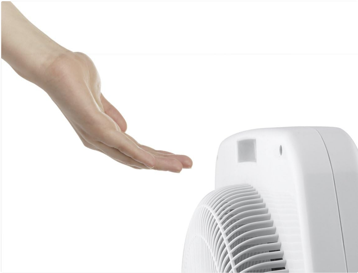
Figure 5.3: The fan provides consistent airflow for effective cooling.