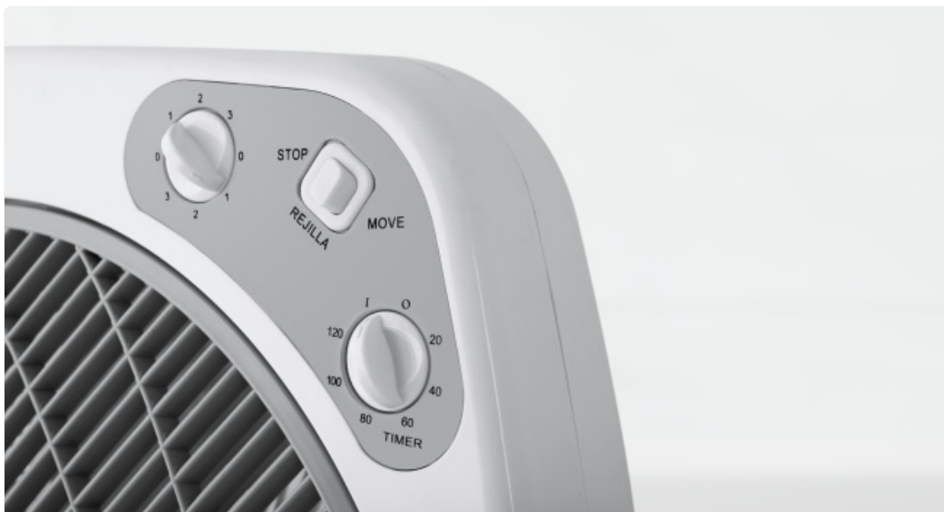
Figure 5.1: The control panel features intuitive knobs for speed and timer, and buttons for grille movement.

Your OrbeGozo Box Fan is designed for ease of use. Follow these steps to operate your fan: