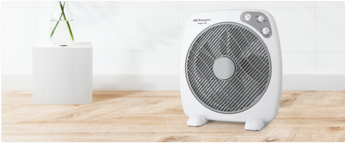
Figure 3.2: The Orbegozo BF 0140 Box Fan positioned in a living space.