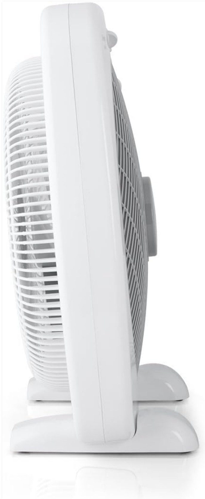
Figure 4.1: Side profile of the fan, highlighting its stable base.