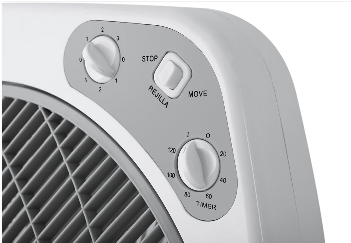
Figure 3.1: Detail of the control panel with speed and timer knobs.

Familiarize yourself with the main parts of your Orbegozo Box Fan.