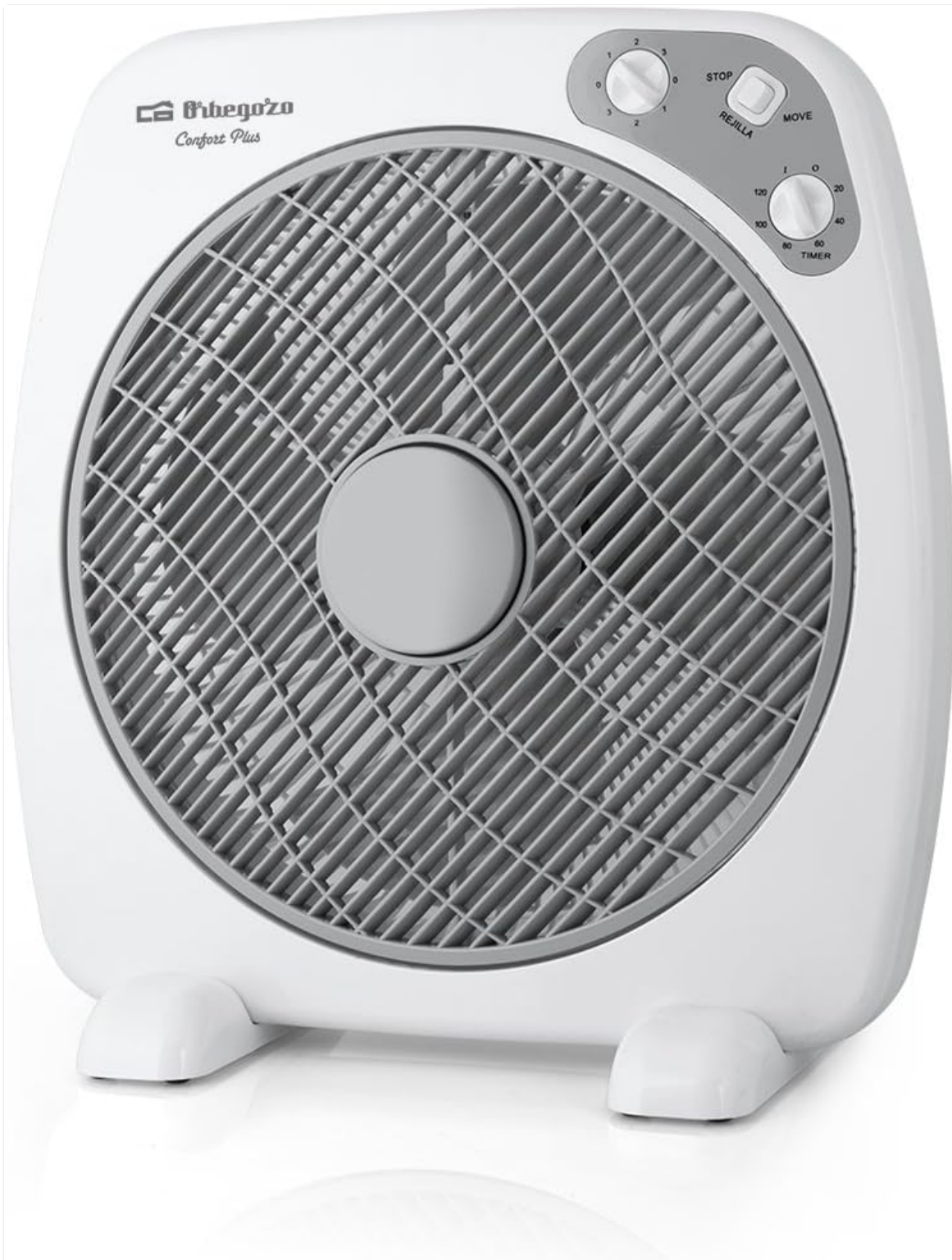
Figure 1.1: Front view of the Orbegozo BF 0140 Box Fan.

The Orbegozo BF 0140 is a powerful and versatile box fan designed to provide optimal airflow and comfort in various indoor environments. It features a 40 cm blade diameter, three speed settings, a rotary diffuser for wide air distribution, and a convenient timer function.