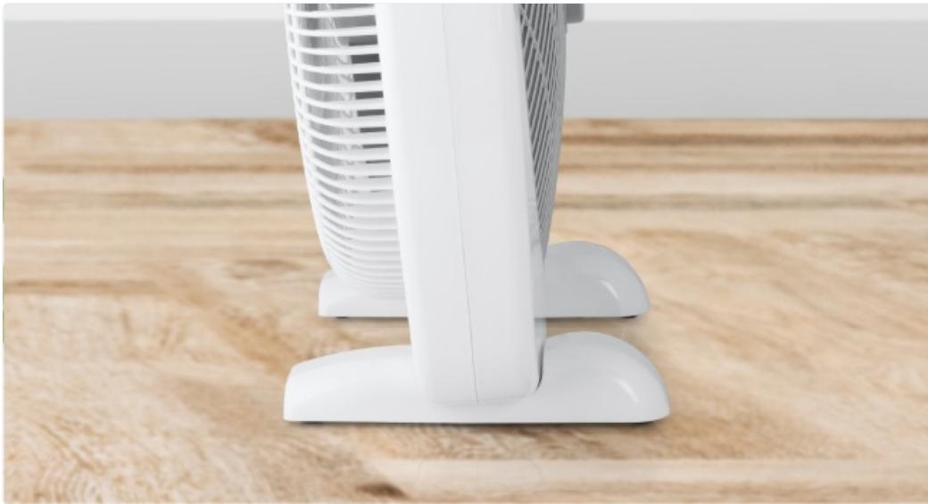
Figure 4.2: The fan's anti-slip feet ensure stability on various surfaces.