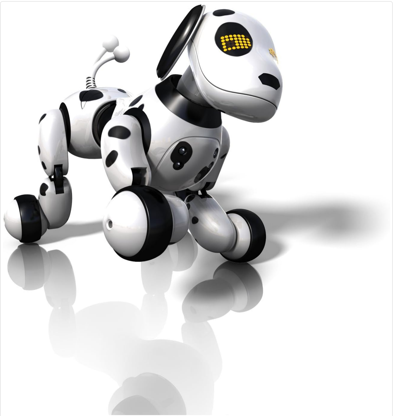
Image: Zoomer in a crouched position, ready to respond to commands.

Zoomer responds to voice commands in English, Spanish, and French. Speak clearly and directly to Zoomer. Patience is key, as Zoomer is like a puppy learning new tricks. Some commands may require repetition.