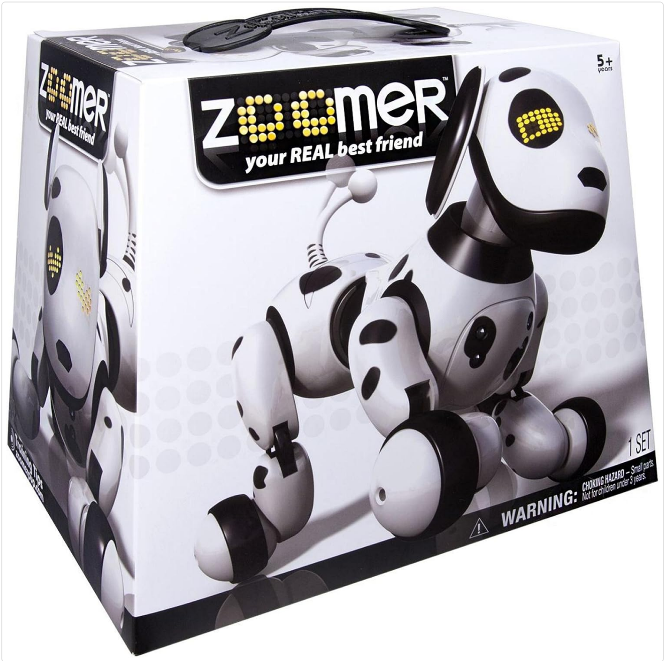
Image: The Zoomer product box, showing the robot dog and branding.