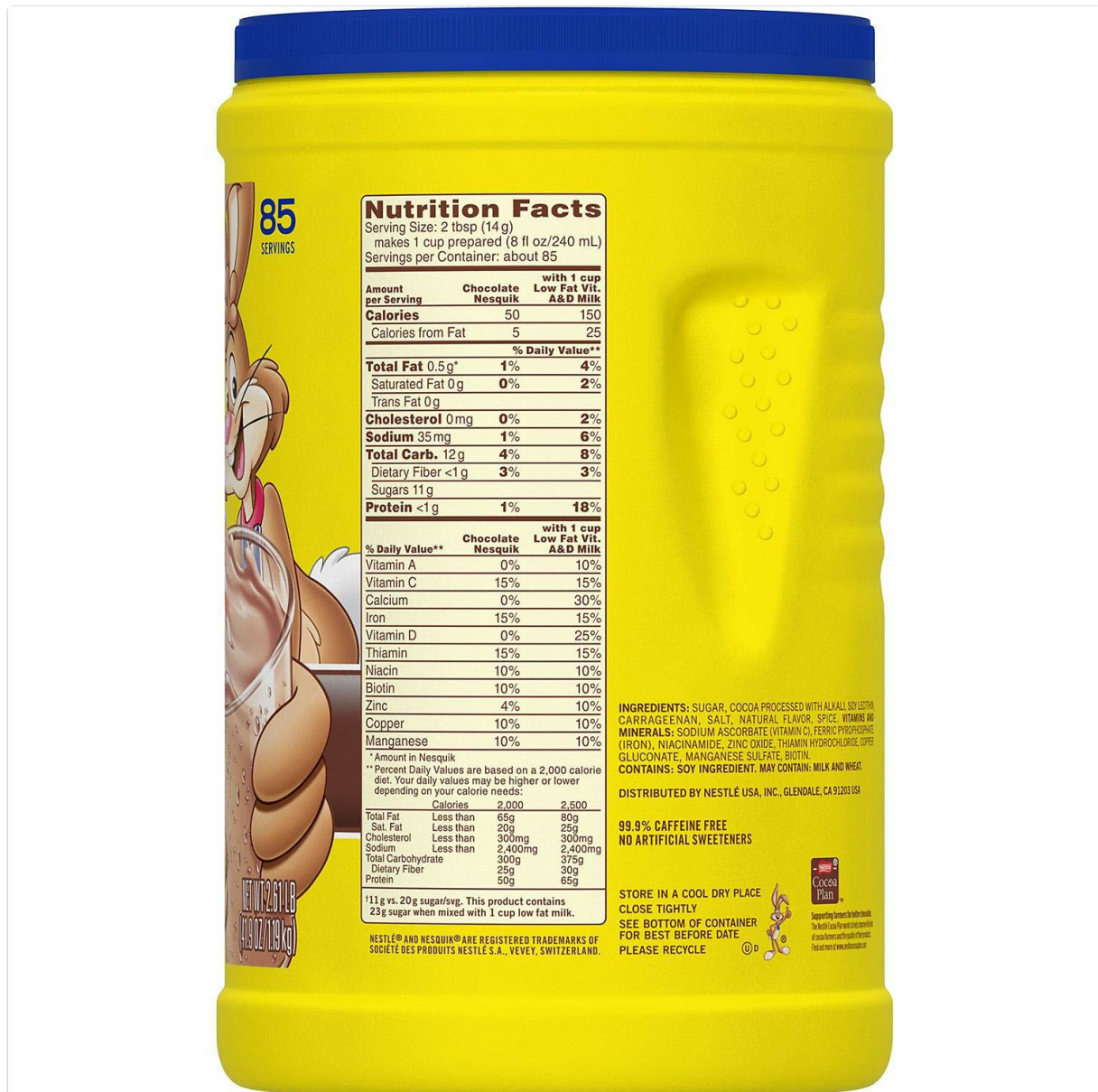
Image: Nutritional Facts label on the Nesquik canister.

*Percent Daily Values are based on a 2,000 calorie diet. Your daily values may be higher or lower depending on your calorie needs.