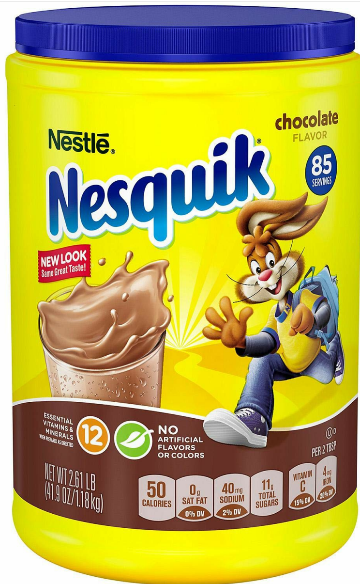
Image: Nestle Nesquik Chocolate-Flavored Powder canister (front view).