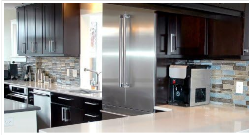
Figure 3: Front view of the CLOVER D1-K, highlighting the hot and cold water dispensing areas and the hot water safety lock.