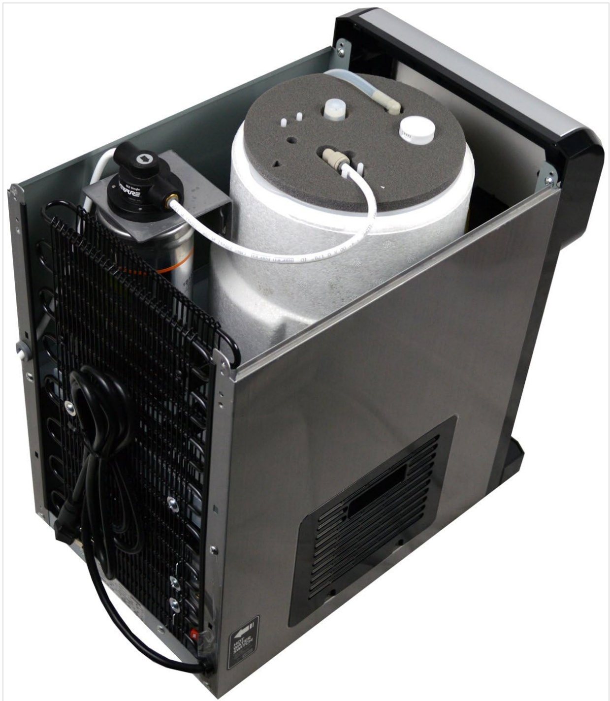
Figure 2: Internal components of the CLOVER D1-K, including stainless steel tanks and filter housing.